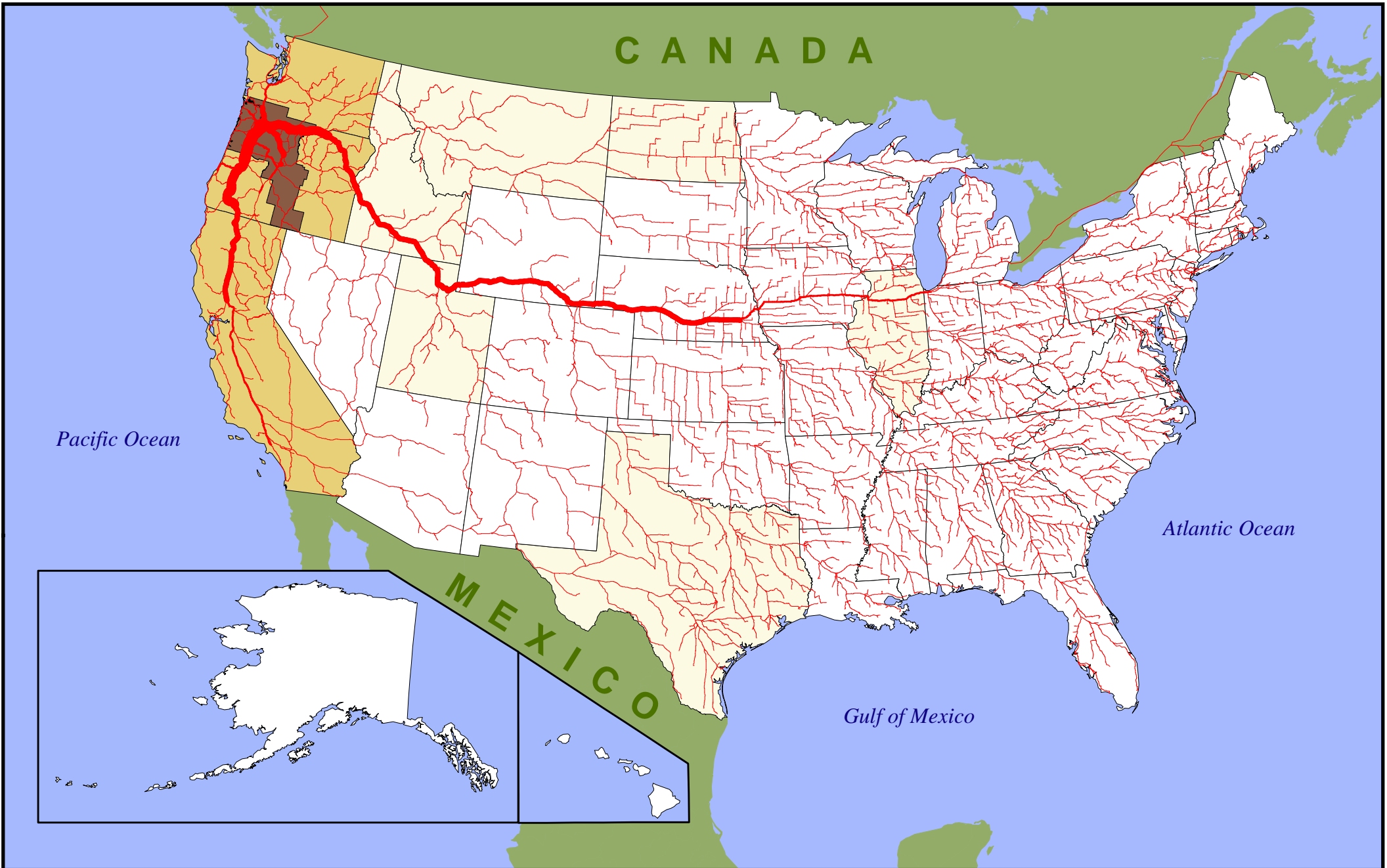
Total Combined Truck Flows (1998)