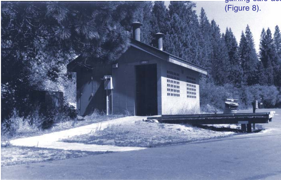
Figure 7—A timber boarding platform built alongside an existing restroom.

The platform should be even with the edge of the roadway or parking area. When modifying an existing site for an accessible ramp, be sure curbs do not interfere with access to the platform. For an individual with limited mobility, inches can make a big difference in gaining safe access from the platform to the boat (Figure 8).