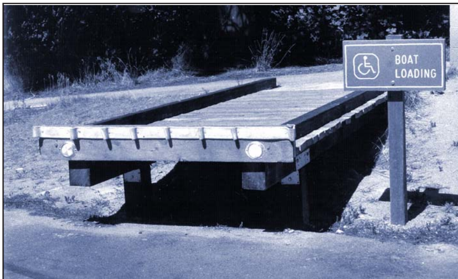
Figure 4—A typical timber ramp.