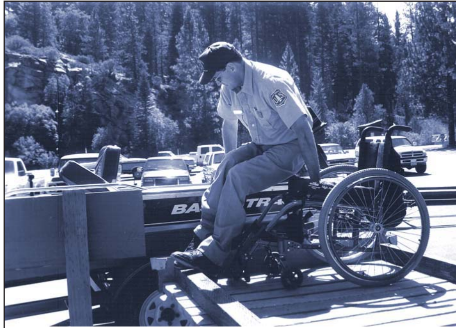
Figure 5—The boarding platform allows passengers to get into a boat while it is still on land, reducing the risks during loading and unloading.

position, the passengers can board. A 1/4-inch-thick steel plate bolted to the end of the platform and protruding up a minimum of 2 inches will prevent wheelchairs from rolling off (Figure 6). After passengers are on board, safely seated, and secured, the driver can proceed to the boat launch. When unloading, the process works in reverse.