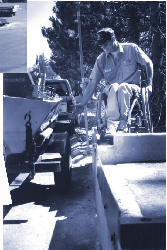
Figure 8—A ramp recessed behind curbs makes loading and unloading difficult.