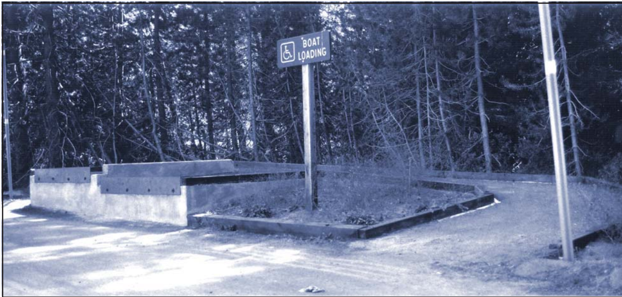
Figure 3—Split-level concrete ramps allow easy access to boats of different heights.

Construction plans for these ramps are included in this doc-ument and are also available on the Forest Service's internal network at http://fsweb.mtdc.wo.fs.fed.us . Any modifications that affect accessibility standards should be documented along with the reason for the modifications and a risk and liability assessment.