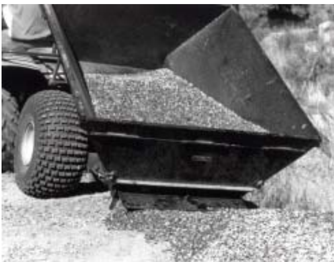
Figure 6—Gravel flow was uniform and adjustable.

remained in the dump position until empty.