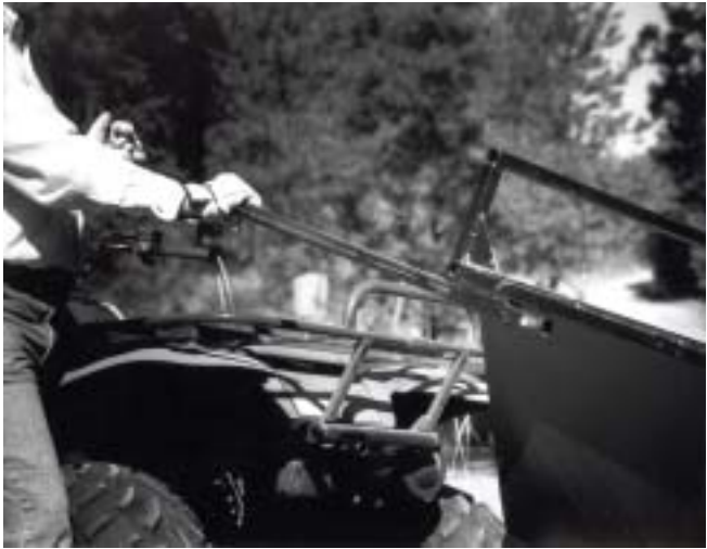
Figure 4—It takes very little effort to operate the dump body.