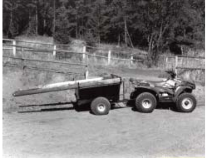
Figure 3—Posts and gravel used for validation testing.

Our test ATV was a 1996 Polaris Magnum 425 four-wheel drive. We loaded the trailer with 800 pounds (360 kg) of gravel, and added five posts (Figure 3) to test it with an overloaded, back-heavy load. The combination handled well up and down the 5 to 10% grades of a typical ATV trail. The ATV had a tendency to lose traction and spin out unless four-wheel drive was engaged. Starting from a stop, the ATV could not pull the trailer out of a short pitch of approximately 25% grade, but did just barely make it after we unloaded the posts.