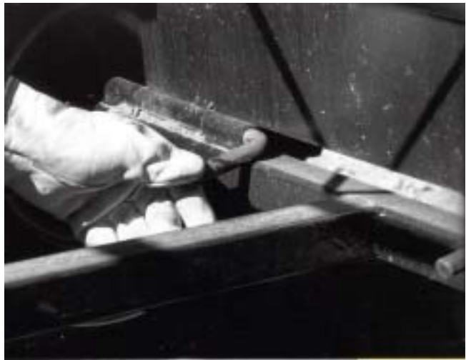
Figure 5—Pull two pins to remove the box.