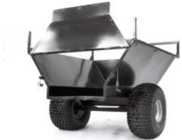
Figure 7—The entire tailgate can be lifted as shown or removed altogether.

When the entire tailgate was unbolted and lifted (Figure 7), it stayed in the raised position so material could be shoveled out. The entire tailgate can be easily removed to haul longer materials in the bed.