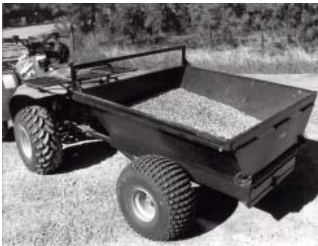
Figure 2—This maximum recommended load of 800 pounds of gravel fills the trailer less than half full.

Experienced ATV operators on the district trail crew have used the trailer safely for several years. In limited validation testing, we determined that when the trailer was three-quarters full of gravel (weighing about 1160 pounds or 522 kg), the ATV could not pull the load up slopes without spinning out, the tires were overloaded, and the ATV did not handle well. Therefore, for actual field testing, we reduced the load of gravel to 800 pounds (360 kg) (Figure 2). This is the amount we recommend as a maximum capacity.