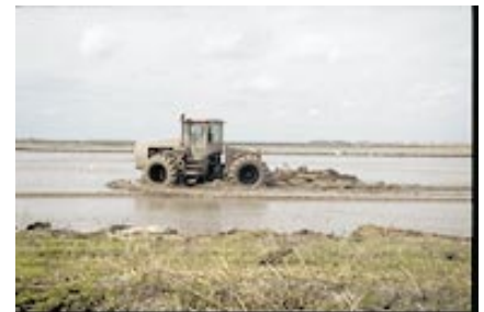
Leveling rice fields in preparation for planting can result in periodic discharges of high-turbidity and high-nutrient water into surrounding waterways. The Acadian-Pontchartrain Study Unit contains over 400,000 acres of rice fields.