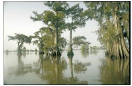
Lake Fausse Pointe, surrounded by a bald cypress forest. Louisiana cypress swamps are threatened by hydrologic modifications, salt-water intrusion, and herbivory by nutria, an introduced rodent.

The study unit is underlain by the Chicot aquifer system, Evangeline aquifer, and Jasper aquifer system west of the Mississippi River; and the Chicot equivalent, Evangeline equivalent, Jasper equivalent, and Catahoula equivalent aquifer systems east of the Mississippi River (also collectively referred to as the Southern Hills aquifer system). These aquifers are composed of alternating beds of unconsolidated gravel, sand, silt, and clay. Beds in the aquifers dip and thicken southward. Recharge occurs primarily from rainfall, and recharge potential is higher in the northern part of the study unit. The Chicot and Southern Hills aquifer systems are designated as sole-source aquifer systems by the U.S. Environmental Protection Agency. In 1995, pumpage from wells in the Chicot and Chicot equivalent aquifer systems totalled 660 Mgal/d. Heavy pumping from these two aquifer systems has substantially altered water levels and caused saltwater encroachment near the cities of Lake Charles and Baton Rouge.