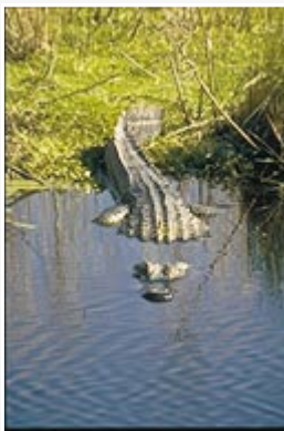
American alligator populations are thriving throughout the southern half of the Acadian-Pontchartrain Study Unit.

The Acadian-Pontchartrain NAWQA study will increase the scientific understanding of surface- and ground-water quality and the natural and human factors that influence water quality. The study also will provide the information needed by water-resource managers to implement effective water-quality management actions and evaluate long-term changes in water quality.