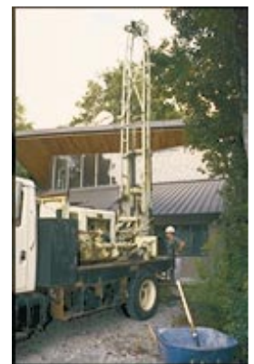
Well drilling at Bluebonnet Swamp Nature Center in Baton Rouge. The well will be used both for age-dating shallow ground water and as an interpretive exhibit for visitors.