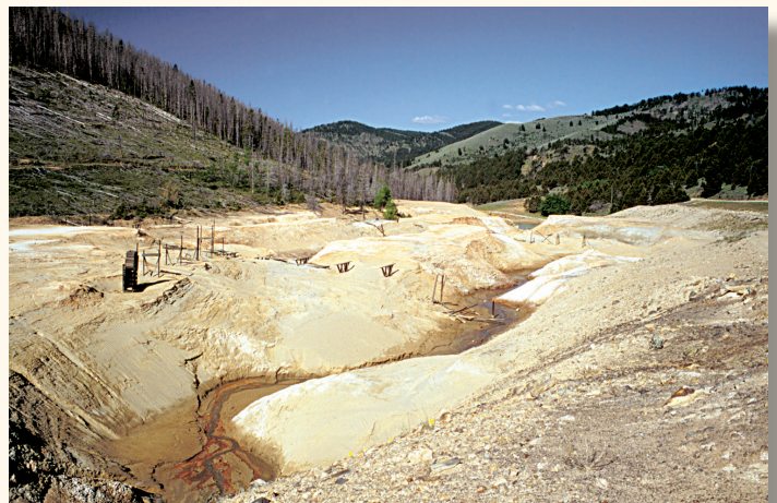
Figure 1. Mill tailings in the High Ore Creek valley before large-scale cleanup activities at the Comet mine site, October 1996.

The major environmental effect of historical mining in the watershed has been impairment of aquatic life in streams. All species of fish were absent in stream reaches downstream from a few large mines because of the high trace-element concentrations caused by acid mine drainage. Farther downstream, trout were found in less contaminated reaches, but exposure to high trace-element concentrations affected the health of these fish. The effects on the fish were shown to result from the trace elements in water through exposure of the gills and in diet through the consumption of aquatic insects.