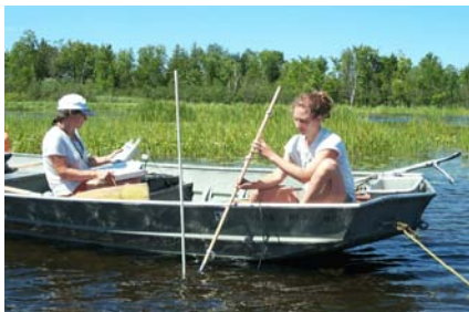
Water quality sampling in a Great Lakes coastal wetland.

A special edition of the Journal of Great Lakes Research (JGLR) summarizes a new generation of indicators for coastal change in the Great Lakes. These environmental indicators are benchmarks for the current conditions of the lakes’ coastal region and provide measurable endpoints to assess the success of future management, conservation, protection, and restoration of this important freshwater resource. Information on indicators is legislatively mandated by the governments of the US and Canada because of public demand to know the status of Great Lakes ecosystems. The new indicators are especially timely because of increasing recognition of human pressures in the coastal zone that affect ecosystem quality and the related services people expect from coastal ecosystems. The need to track coastal conditions recently has become a special emphasis of the International Joint Commission and is a major discussion area as revisions to the US-Canada Great Lakes Water Quality Agreement (GLWQA) are being considered.