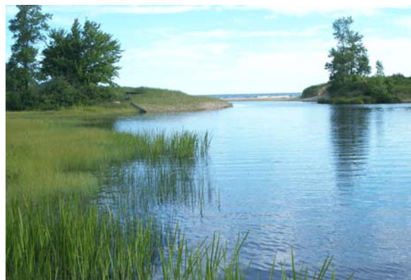
This coastal wetland on Lake Superior has little watershed disturbance, good water quality, and low \delta^{15}\text{N} in organism tissues.