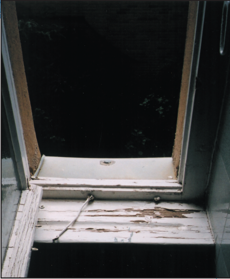
Leaky window – mold is beginning to rot the wooden frame and windowsill.

If you already have a mold problem – ACT QUICKLY.