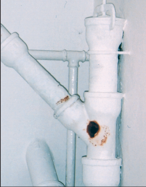
Rust is an indicator that condensation occurs on this drainpipe. The pipe should be insulated to prevent condensation.

Renters: Report all plumbing leaks and moisture problems immediately to your building owner, manager, or superintendent. In cases where persistent water problems are not addressed, you may want to contact local, state, or federal health or housing authorities.