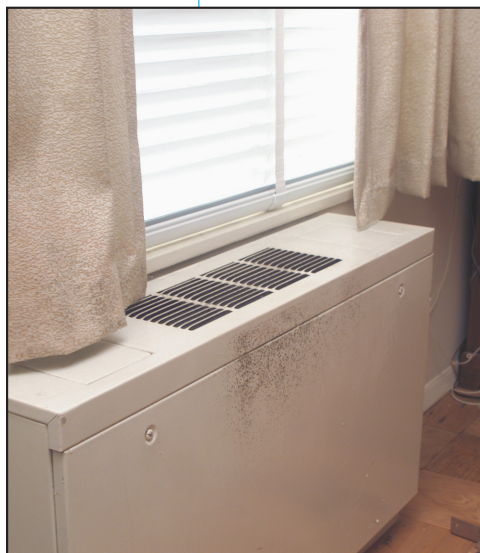
Mold growing on the surface of a unit ventilator.