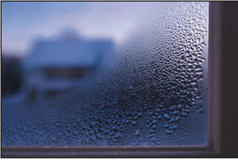
Condensation on the inside of a windowpane.