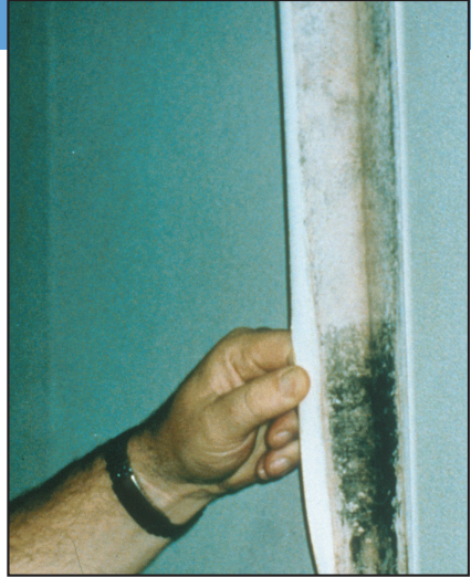
Mold growing on the back side of wallpaper.

Suspicion of hidden mold You may suspect hidden mold if a building smells moldy, but you cannot see the source, or if you know there has been water damage and residents are reporting health problems. Mold may be hidden in places such as the back side of dry wall, wallpaper, or paneling, the top side of ceiling tiles, the underside of carpets and pads, etc. Other possible locations of hidden mold include areas inside walls around pipes (with leaking or condensing pipes), the surface of walls behind furniture (where condensation forms), inside ductwork, and in roof materials above ceiling tiles (due to roof leaks or insufficient insulation).