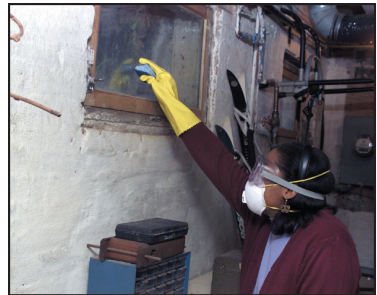
Cleaning while wearing N-95 respirator, gloves, and goggles.

■ Wear goggles. Goggles that do not have ventilation holes are recommended. Avoid getting mold or mold spores in your eyes.