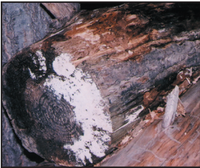
Mold growing outdoors on firewood. Molds come in many colors; both white and black molds are shown here.

Molds are part of the natural environment. Outdoors, molds play a part in nature by breaking down dead organic matter such as fallen leaves and dead trees, but indoors, mold growth should be avoided. Molds reproduce by means of tiny spores; the spores are invisible to the naked eye and float through outdoor and indoor air. Mold may begin growing indoors when mold spores land on surfaces that are wet. There are many types of mold, and none of them will grow without water or moisture.