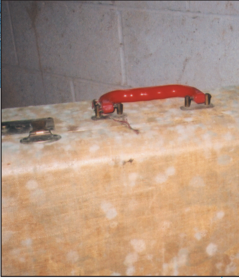
Mold growing on a suitcase stored in a humid basement.

It is important to take precautions to LIMIT YOUR EXPOSURE to mold and mold spores.