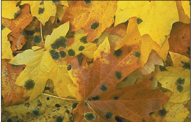
Mold growing on fallen leaves.

This document is available on the Environmental Protection Agency, Indoor Environments Division website at: www.epa.gov/mold