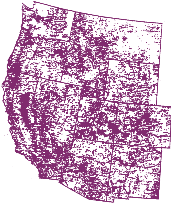
Distribution for 117,000 MILS data points

The Minerals Industry Location Systems (MILS) dataset was a subset of the Minerals Availability System database formerly maintained by the U.S. Bureau of Mines. MILS contains information on locations of mines, their operational status, and their associated minerals. From 64 fields of the MILS dataset, a subset consisting of sequence number, name of deposit, deposit type, current status, location, and point of reference is included in these database releases.