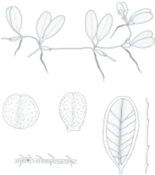
Paddle grass.

Distribution – This pantropical species is found mostly in the warmer water of the Northern Gulf Region. Extensive acreage of seasonal beds have been observed in southern Florida.