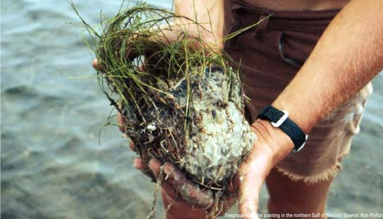
Seagrass ready for planting in the northern Gulf of Mexico.