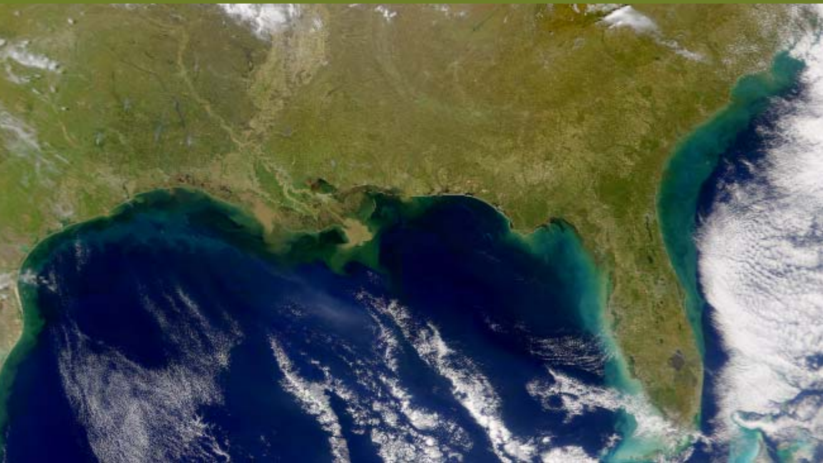
Gulf of Mexico.