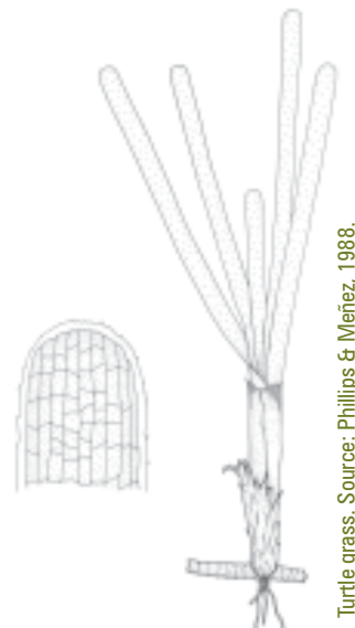
Turtle grass.

Description – Thalassia testudinum is often found from just below the low tide surface to depths of 30 m in clearer waters. This plant generally prefers mud or sand substrate