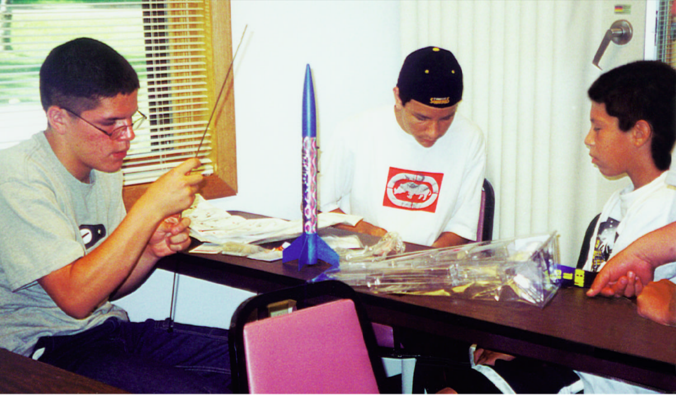
Students working on their model rocket