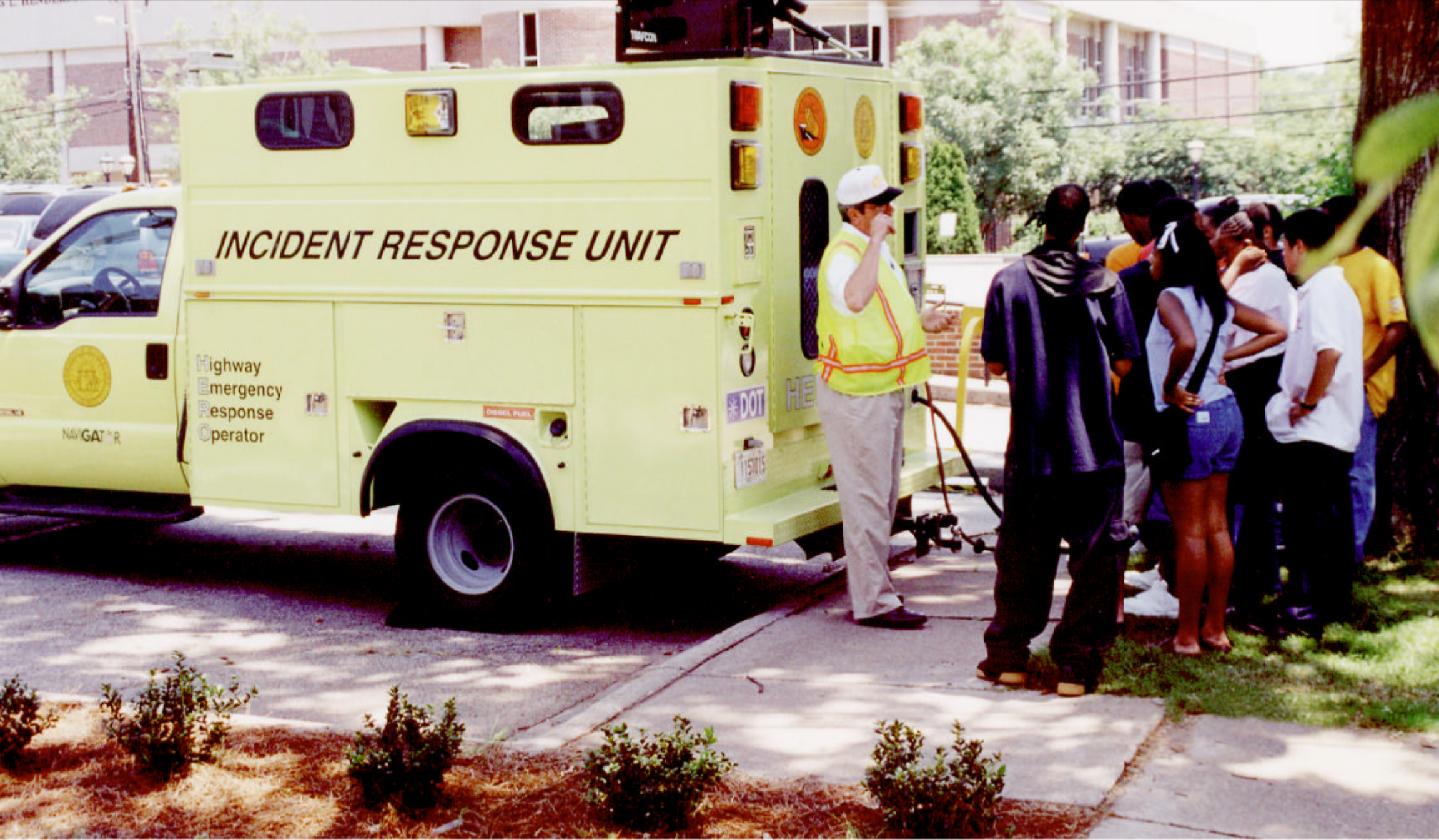
A transportation worker explains the function of the incident response unit