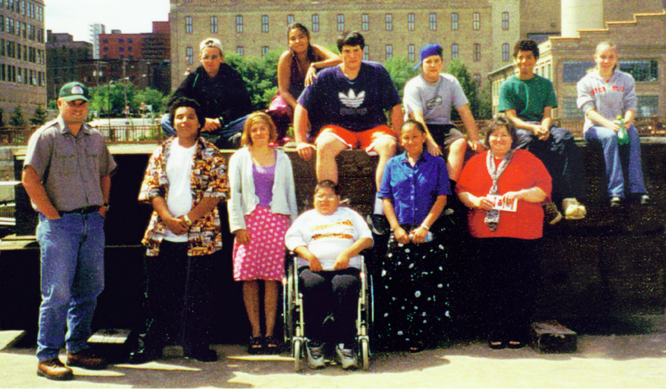
The team gathers for a group shot