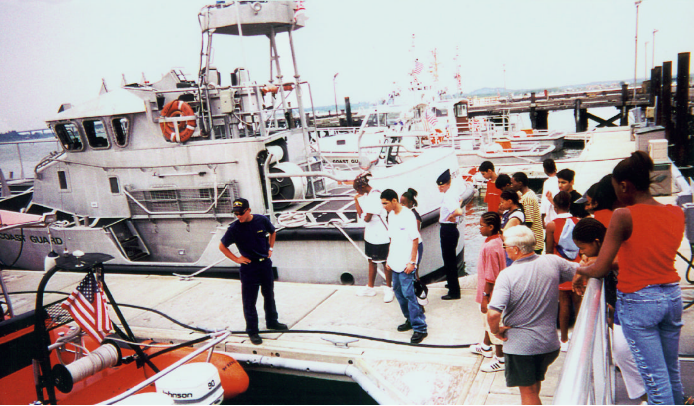
A dock visit to a U.S. Coast Guard vessel