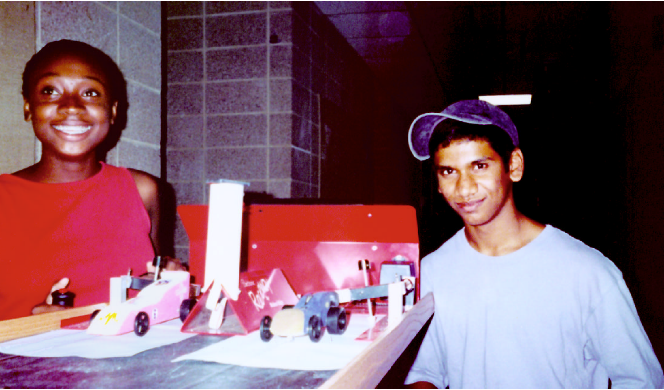
Students participate in model dragster race