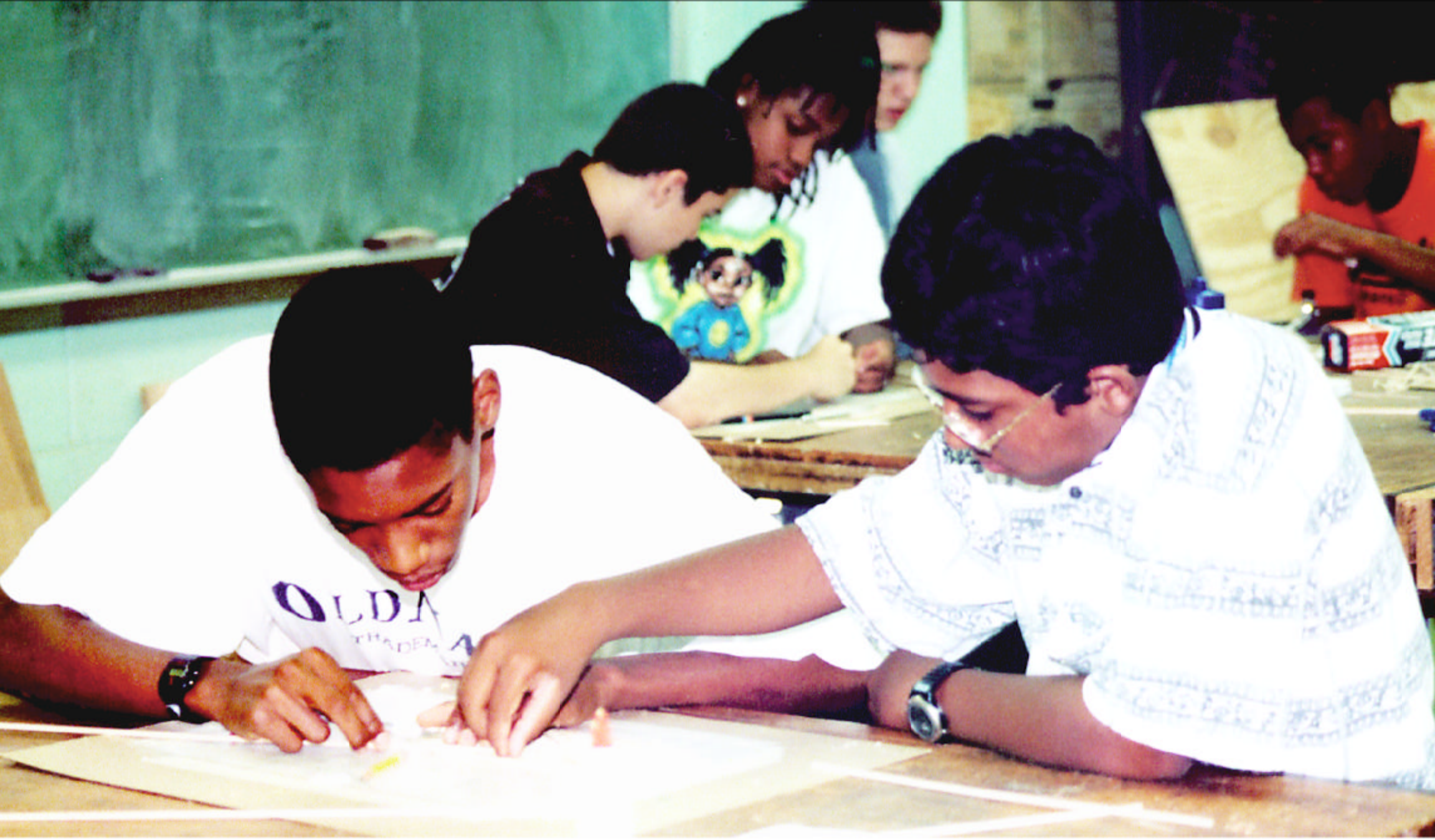
Students working on their model bridge