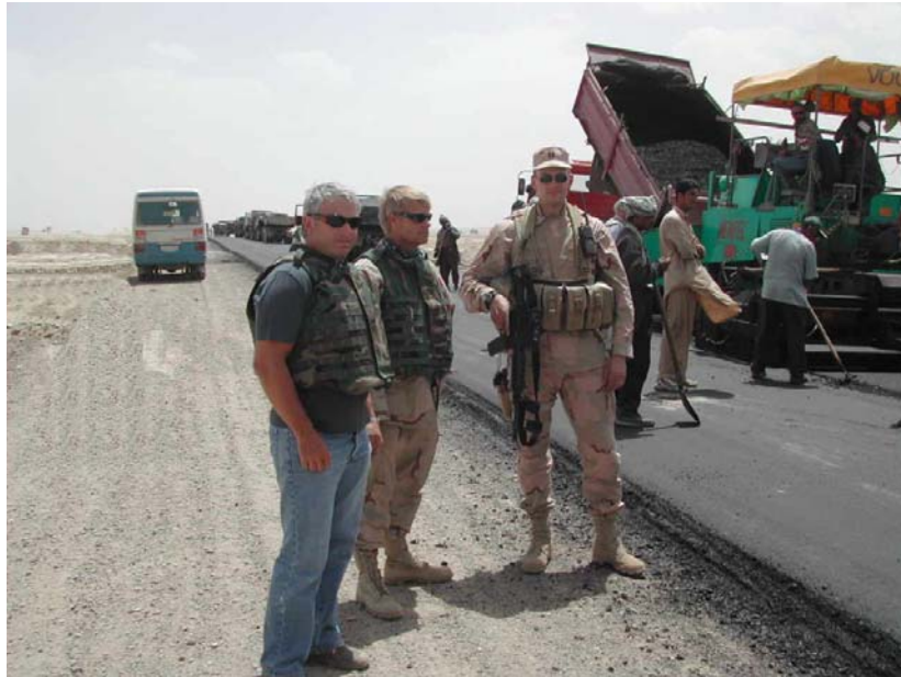
A photograph of a RIG/Manila auditor and U.S. Army personnel observing a subcontractor applying asphalt. This photograph was taken in June 2004 about 120 kilometers west of Kabul, Afghanistan.

However, USAID/Afghanistan did not always monitor the timeliness of the Kabul-Kandahar highway reconstruction activities, nor did it closely monitor the quality of the roadwork.