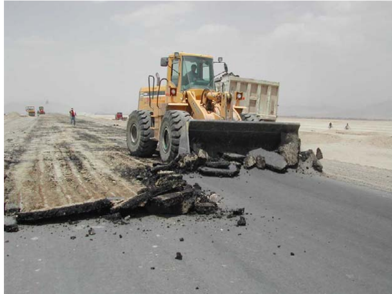
A photograph of a subcontractor removing defective asphalt. This photograph was taken in June 2004 about 125 kilometers west of Kabul, Afghanistan.

develop and submit to USAID for approval a comprehensive quality control and assurance program. Although LBGI developed a 5-page document outlining its quality control and assurance program, it was not comprehensive, nor was it submitted to or approved by USAID.