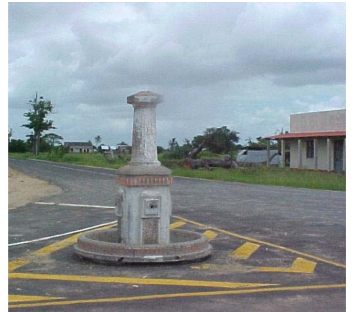
Above are photos of the EN211 road segment taken at a water fountain in Nova Mambone, Mozambique. The pre-reconstruction photo on the left was taken in November 2001 and the post-reconstruction photo on the right was taken in February 2004.

In response to Recommendation No. 2, the Mission has taken corrective action to justify final action on this recommendation. This required that the Mission conduct a current performance evaluation of the two engineering consulting firms