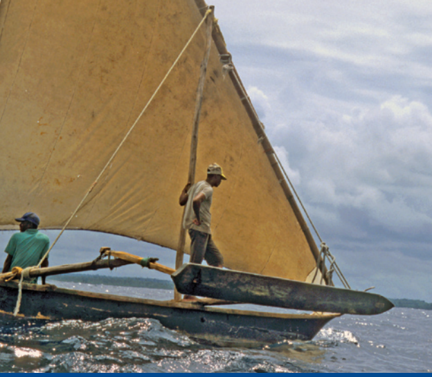
In the East Africa Marine Ecoregion, GCP partner World Wildlife Fund is helping fishing communities in the coastal waters of Kenya, Tanzania, and Mozambique work with government agencies to collaboratively manage a system of marine protected areas, resulting in regenerated fisheries and coral ecosystems, and improved coastal livelihoods.