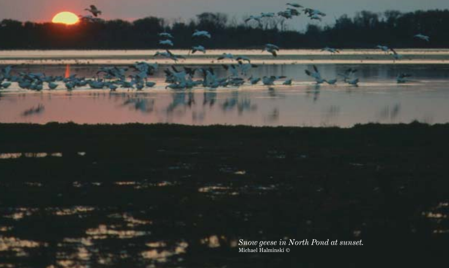
Snow geese in North Pond at sunset.

Situated on Hatteras Island on the Outer Banks of North Carolina, it was established to provide habitat for migratory birds, primarily waterfowl, and other wildlife.