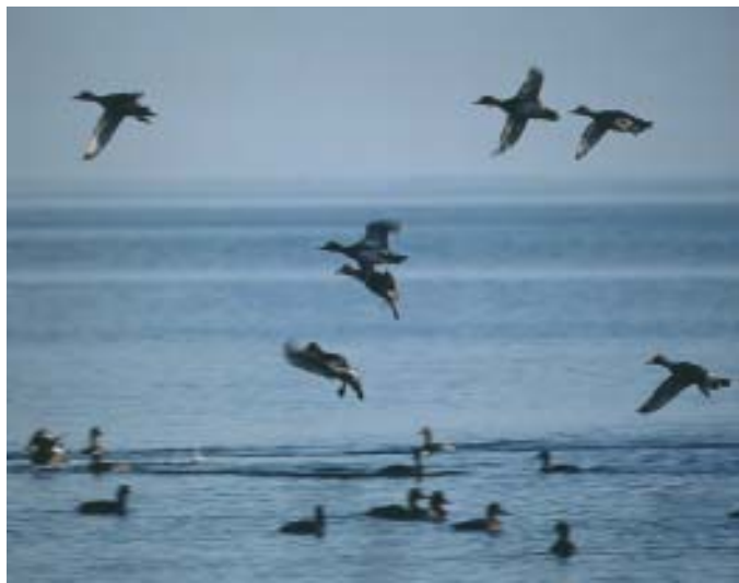
Redheads in Pamlico Sound.