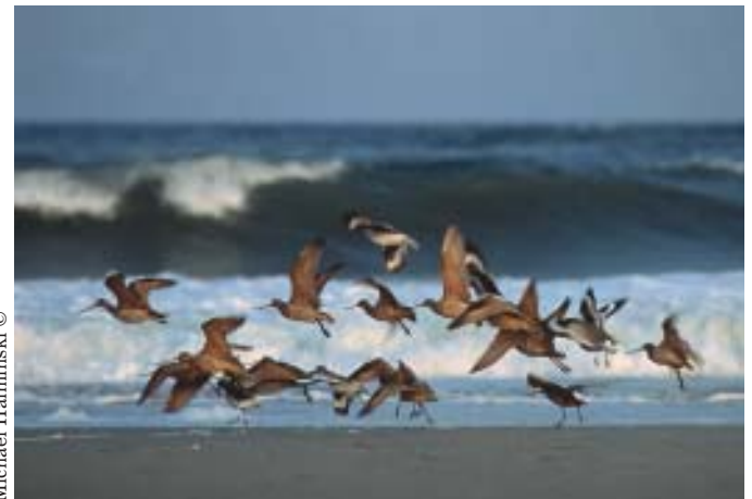
Michael Halminski ©

Above, from top: Strophostyles helvula (beach or dune pea), namesake for Pea Island; lone semi-palmated sandpiper in winter plumage. Below: Marbled godwits and willets on Atlantic shore.