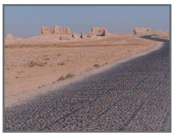
Photograph of a cobblestone farm-to-market road built under the cash-for-work program.

OIG found that USAID/Afghanistan's program achieved some planned results, such as increasing the number of seasonal and full-time jobs through infrastructure projects and training farmers in agricultural techniques and product marketing. However, despite the program's progress, opium production continued to rise. The