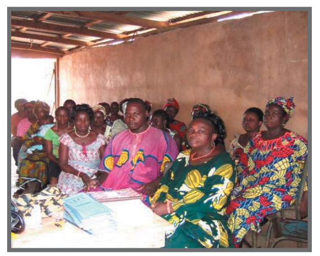
Photographs of two groups that are benefiting from USAID/Nigeria's microfinance program. Credit officers meet with the groups weekly to collect the loan payments and mandatory savings deposits. Both groups indicated that the loans enhanced the ability to grow their businesses.