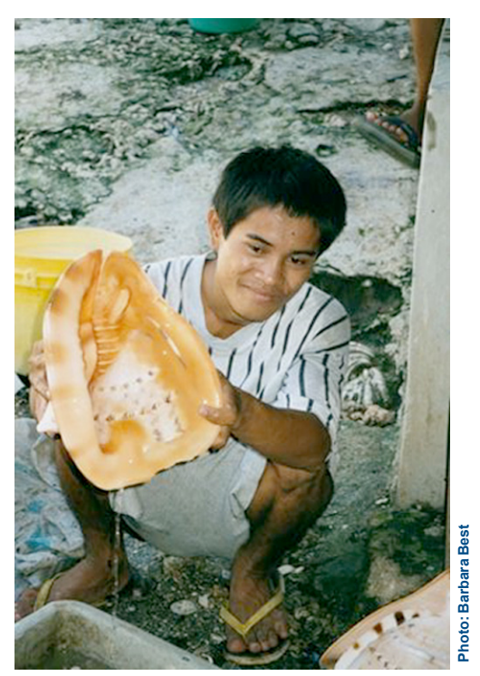
Child cleaning seashell in Cebu, Philippines

Collectors face serious health problems due to improper hookah and diving practices that lead to