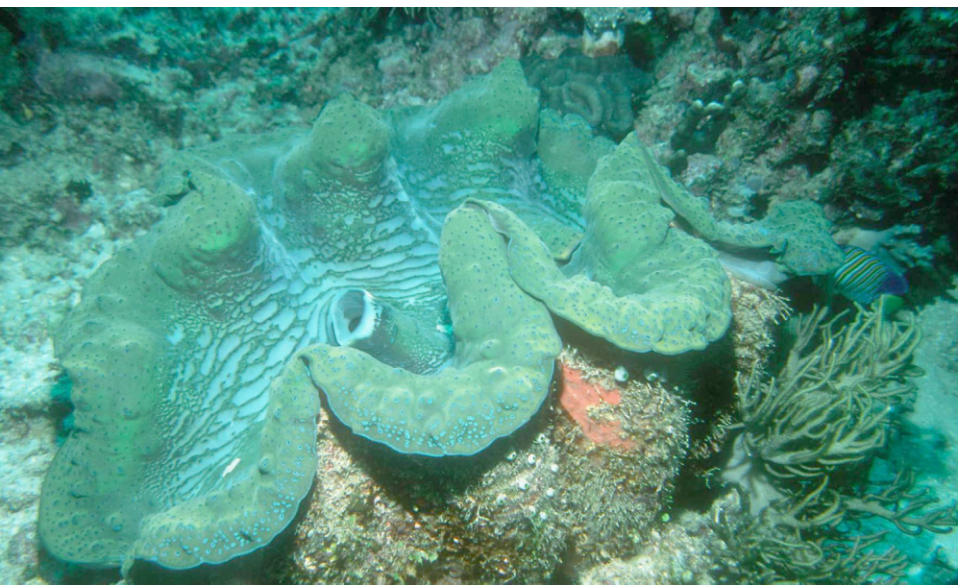
Giant clam on coral reef in Raja Ampat, Indonesia

N many countries, domestic and international trade in coral reef species and products is driving the overexploitation of reef resources and the use of destructive fishing practices that destroy reef habitats. These unsustainable and destructive practices are altering the ecosystem functions of reefs and greatly diminishing long-term benefits to local communities. Although often referred to as "productive" ecosystems, coral reefs can be easily overexploited and must be carefully managed and monitored. Coral reefs are characterized by many species