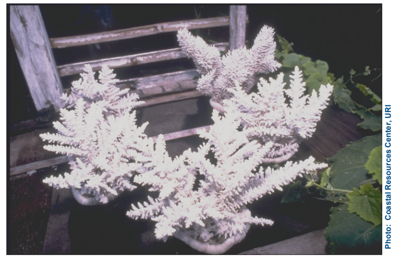
Coral for sale in Lampung, Indonesia

are critical habitats for many reef fishes during some portion of their life-history. For example, one study documented that most reef fish species were absent, or present only in reduced densities, in those bays or island reefs lacking these critical nursery habitats (Nagelkerken et al., 2000).