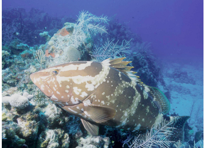
Nassau Grouper in Grand Cayman

Exploitation of reef fishes appears to be increasing, with a pronounced growth in international trade adding pressure to limited resources. In addition to traditional fisheries, pressure is growing on species being taken in new, nontraditional fisheries, such as the marine aquarium trade, the live reef food fish trade and the trade in fish fry for mariculture. The live reef fish trades may be quite selective in terms of both species and are attractive for aquaria or