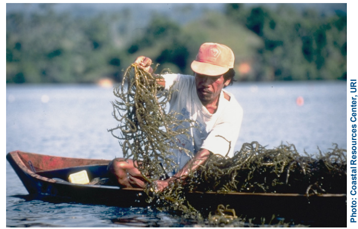
Seaweed farming in East Kalimantan, Indonesia

indeterminate growth among modular taxa suggests that colonies readily recover from harvesting, and that they can be easily partitioned to generate brood stock for mariculture. However, one study on the Caribbean gorgonian Pseudopterogorgia elisabethae —harvested for the extraction of commercially valuable pseudopterosins illustrates that this assumption is incorrect (Lasker, 2000). An analysis of growth patterns in P. elisabethae indicates that it has "determinate" growth. Therefore, the assumptions about the resilience of colonies to harvesting are probably inaccurate. Species-specific analyses may be required to develop management plans and mariculture techniques.