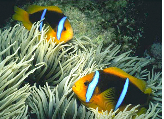
A pair of orange, white, and black Clark's Anemone Fish in their green host anemone, Fiji

Although improvements have been made in the husbandry of coral reef animals, there are a large number of species collected and sold for the marine aquarium trade, which continue to have low to dismal chances of surviving in aquaria. Included in this group are most azooxanthellae anthozoans, many filter-feeding invertebrates, and certain fishes. The main reasons that these animals do not survive in aquaria are related to diet and the inability of aquaria to supply sufficient amounts or types of nutrients. Expert hobbyists, retailers and researchers have documented many of these animals, which are inappropriate for the trade; a report compiling all these observations was presented, which includes several hundred species.