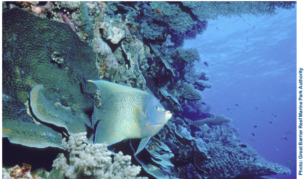
Angelfish, Great Barrier Reef, Australia

Sri Lanka: For many years the marine ornamental export trade in Sri Lanka was not monitored or regulated, and there were concerns about possible environmental impacts of the fishery. A collaborative program involving resource managers and the ornamental industry was initiated to develop a conservation management plan. Population censuses, along with user assessments, were brought together to produce a plan for the conservation and management of marine ornamental resources that is acceptable to all stakeholders and thus more likely to succeed.