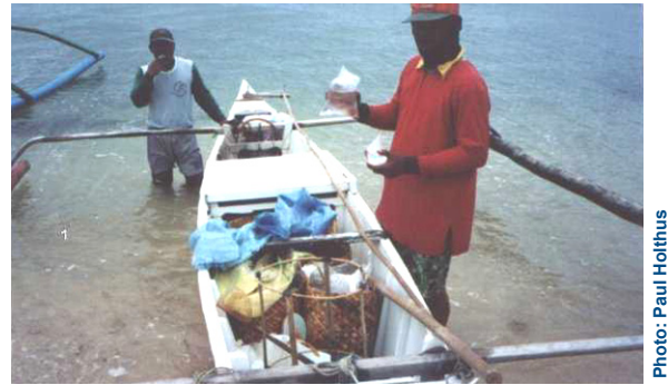
Ornamental fishers and boat on shore

Over forty countries have a marine aquarium fishery based on coral reef species. It is estimated that over 1000 different species of fish and invertebrates, as well as live reef substrate or "live rock," are presently involved in the trade. At least 20 million fish are captured annually to supply hobbyists primarily in the United States, European