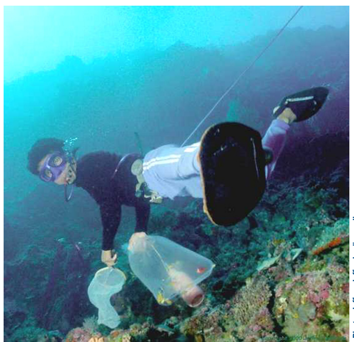
Fish collector employs cyanide in reef fish collection, Capone Islands, Philippines

as well. The U.S. National Marine Fisheries Service is increasing efforts to remove derelict fishing gear in the Hawaiian Islands. The International Marinelife Alliance's Destructive Fishing Reform Initiative, carried out in partnership with a wide variety of other NGOs and government agencies throughout the Asia-Pacific, is using a combination of education for both fishers and government agencies, enforcement, and monitoring of the live reef fish trade to combat cyanide fishing (and prevent its introduction into new source countries), overfishing and other abuses in the live reef fish trade. The Marine Aquarium Council in the United States is leading an effort to establish a certification system for aquarium organisms in international trade.