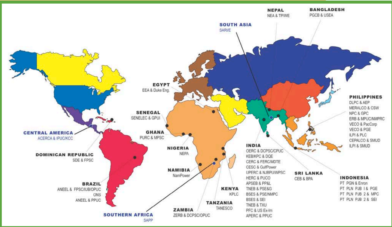
Energy Partnership Program works in Africa, Asia, and Latin America and the Caribbean.