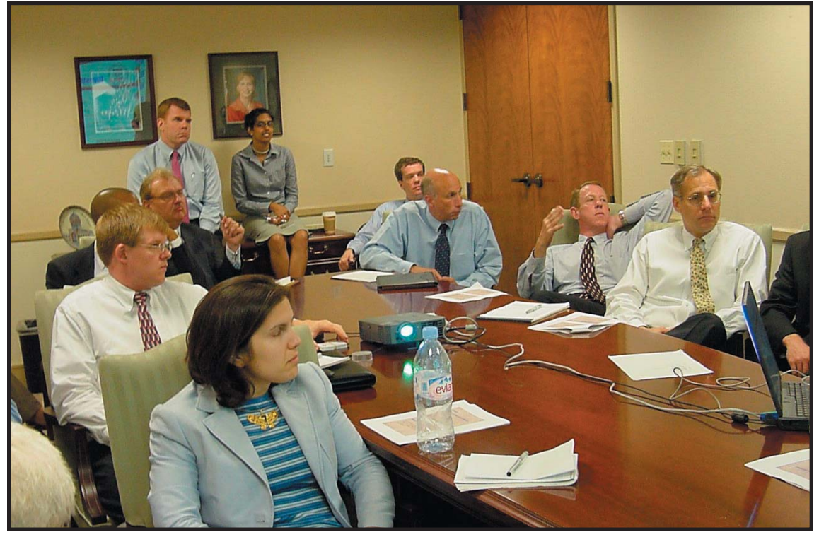
Photograph on the OIG presenting its first fraud awareness briefing to staff of MCC.

The OIG also discussed the best use of its audit and investigative resources by deploying those resources to address the Corporation's most significant issues, thereby adding value to the Corporation and at the same time keeping the Corporation's stakeholders informed through the OIG reporting process. To decide on the best use of OIG resources, the OIG stated that it must keep abreast of the Corporation's activities. One of the ways the OIG will do so will be to bring the Corporation into the OIG's annual planning process to learn the Corporation's concerns and priorities.