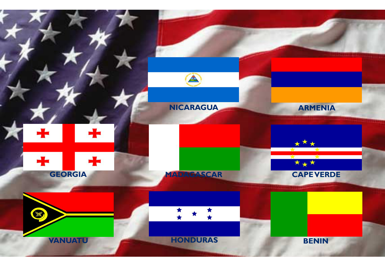
October 1, 2005 - March 31, 2006