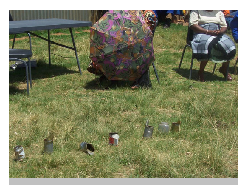
Photograph of voting system used by villagers to identify priorities for potential development assistance funding. Village representatives vote by placing stones in cans which represent different program options.