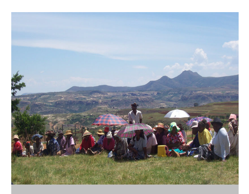
Photograph of village residents discussing local needs in anticipation of a future MCC Compact.

Some of the needs identified were (1) water in the villages, (2) bridges and roads, (3) proper sanitation facilities, and (3) getting products to markets.