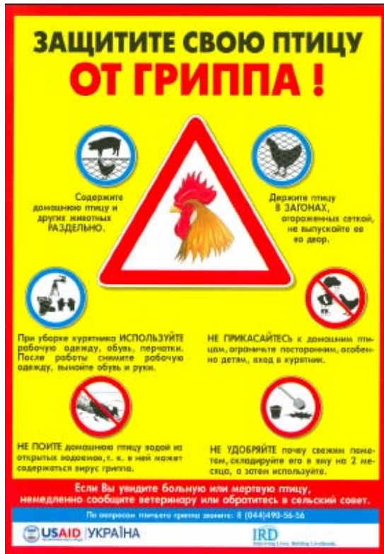
A flier used for USAID's avian influenza awareness activities in Ukraine. USAID is also providing support to train journalists in Ukraine, which has experienced outbreaks in birds, about how to accurately report on the disease.