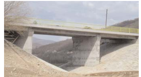
The Orlan Bridge in Podujevo Municipality was restored by USAID / CISP