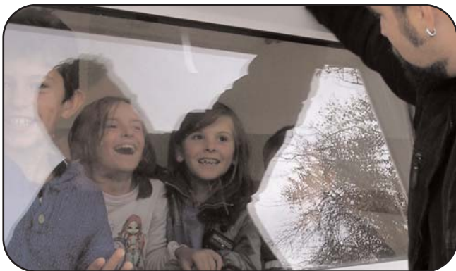
Young students peer through a window of their newly constructed school in Kamenica Municipality.

USAID is helping to restore normalcy in living standards and provide greater opportunities for Kosovars and their communities. Through the Community Infrastructure and Services Program (CISP) and the Kosovo Assistance Program (KAP), USAID has successfully engaged individuals, groups and communities to promote and encourage self-determination and self-reliance that supports community development. While employing this method of community involvement, infrastructure rehabilitation projects have been selected under the CISP initiative to repair vital structures and utilities. Additionally, income generation, social service improvements and children and youth projects under the KAP initiative have attended to the needs of some of Kosovo's most vulnerable groups. These programs have responded to community priorities, and have been driven by the needs of Kosovars - supporting sustainable long-term development and growth at the community level.