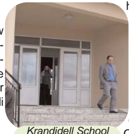
Kranidell School today