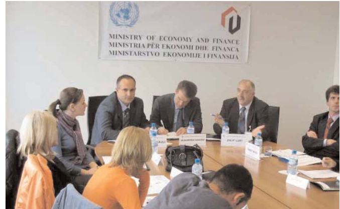
Presenting the taxation system

In addition, a Tax Administration representative provided an overview of the taxation system, the Tax