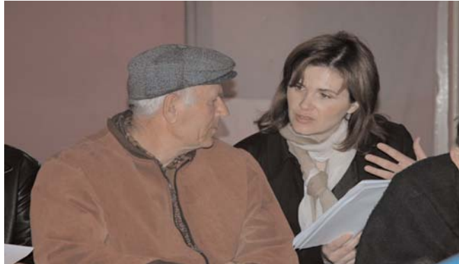
KCSP staff explaining to a civil society representative eligibility criterias for grant application (Ferizaj/Urosevac )

The Kosovo Civil Society Program (KCSP) is three-year initiative funded by the United States Agency for Internat-