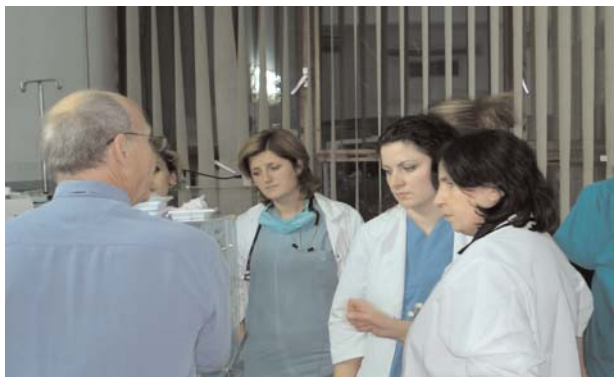
Learning by doing: US Doctors apply new methodologies at the unit