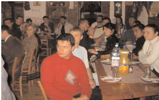
Party Training Academy: Certificate Awards Ceremony

The USAID supported National Democratic Institute (NDI) honored the first graduates of the Party Training Academy class comprised of Serbian Kosovar political parties. At the ceremony, NDI also announced the beginning of the second round of training for young Serbian Kosovar political activists.