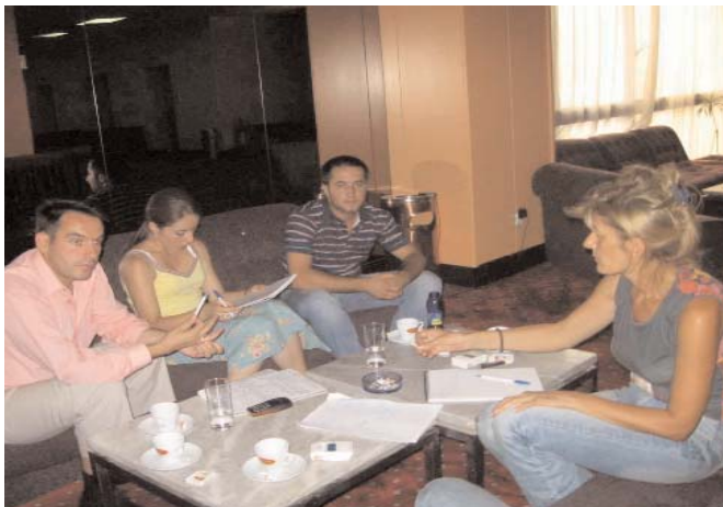
Members of KTR discuss upcoming projects

After the successful launch of the Kosovo Team Reporting (KTR) documentaries, USAID's Support to Peace and Stability Initiative is continuing with "Kosovo Realities", a TV Magazine series produced by multi-ethnic teams of journalists.