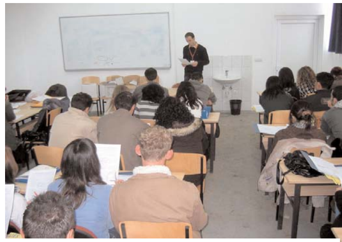
Training of NGO activists who volunteered to monitor November 2007 elections.

USAID contributed to a smooth election process by providing assistance to the Central Election Commission in conducting a major voters' education campaign in Kosovo and to the diaspora, as Kosovars living abroad were eligible to vote. USAID also provided support to Democracy in Action, a coalition of eleven non-governmental organizations, in monitoring all three elections.