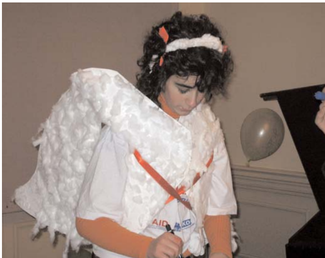
Peja/Pec, December 1 - Following the maskball, PEN activists prepared for the STOP AIDS Concert

Kosovo currently has a fairly low HIV prevalence rate. However, Kosovo's young population—as many as 60% of Kosovars are under age 25—gives rise to concern among medical professionals and HIV/AIDS activists. There remains a need for continuous, Kosovo-wide education about HIV/AIDS.