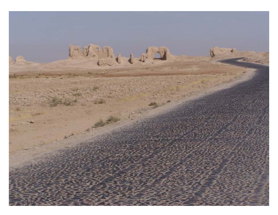
Photograph of a cobblestone farm-to-market road built under the cash-for-work program. (Office of Inspector General, November 2007).

• Total labor days for cash for work. Cash-for-work programs were slightly behind schedule. However, the mission has greatly accelerated the program and plans on continuing to use cash for work to support its other efforts under ADP/S. For example, ADP/S initiated a cash-for-work program to clean the irrigation canal leading to the village of Karez in Helmand Province. The mission met 88 percent of its target in this area.