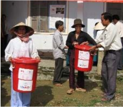
USAID distributing relief supplies to residents of the central provinces after Vietnam was hit by typhoon Xangsane.