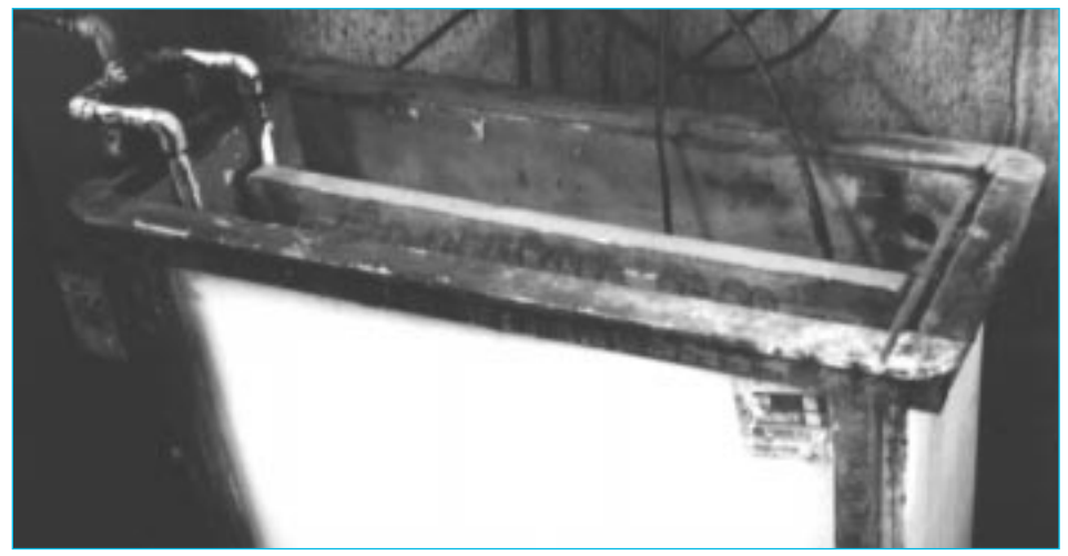
T.S. Designs' enclosed reclaim tank has cut the company's use of water in half.

The firm sought out ways to improve its ink removal and emulsion removal processes at every level. Beginning with the carding out phase, it