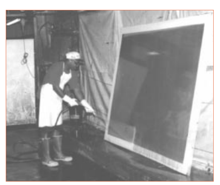
Screen reclamation with a high-pressure water system

One of the benefits of solvent reduction is that it almost always saves money. All told, Action Graphics' new system saves $9,400 a year in operating costs. Since the one-time capital cost for the system was only $13,300, it paid for itself in less than 16 months.