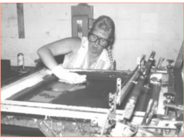
Screen cleaning with a slowly evaporating press wash

Workers did not like switching to this new solvent, however. Since it evaporates more slowly, press operators were concerned that they would have to check more carefully to see if it was completely