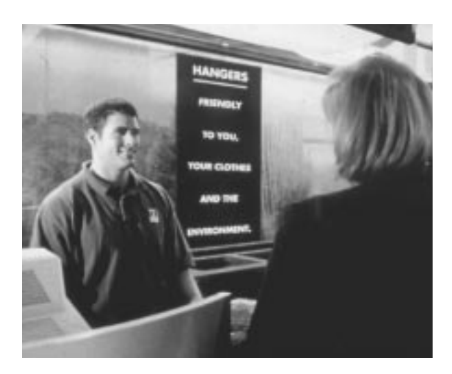
Service Counter at a Hangers<sup>™</sup> Cleaners Store

Micell works closely with the North Carolina State University (NCSU) College of Engineering and the College of Textiles. The company's research in the area of liquid CO<sub>2</sub> cleaning technology has resulted in the issuance of new patents to Micell. In addition, Micell has licensed patented cleaning agent components from the University of North Carolina at Chapel Hill and from Pacific Northwest National Laboratories. These cleaning agent developments have been extended by Micell's team of scientists and engineers, resulting in the high performance and cost effective liquid CO<sub>2</sub> cleaning solution used in the Micare<sup>TM</sup> system's MICO<sub>2</sub><sup>TM</sup> machine.