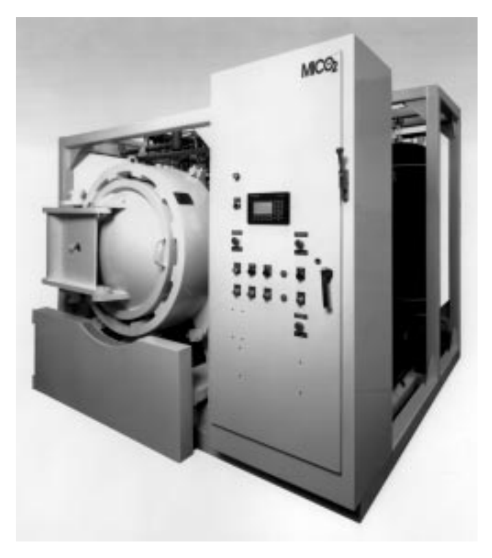
The Micare<sup>TM</sup> System MICO<sub>2</sub><sup>TM</sup> Machine

Micell Technologies asserts that the Micare<sup>TM</sup> system offers excellent cleaning performance across most garment components and a wide range of stains and soils. Also, since liquid CO<sub>2</sub> technology operates at room temperature, any stains that may remain on a garment after the wash cycle are not heat-set as can occur with traditional drycleaning systems. Because stains are not heat-set, post-spotting is very effective. In addition, the company has developed effective pre-treatments to further facilitate cleaning performance.