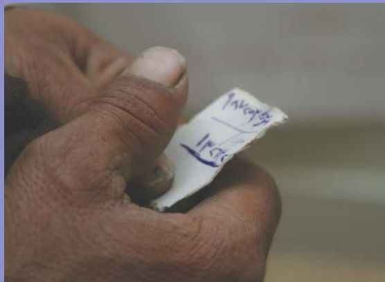
An Iraqi holding the name of a victim on a scrap of paper, searches a list of victims.

Baath party members piled out of the Land Cruiser and another bus and began loading their weapons. Muhaned and the others were escorted off their bus and forced to crouch at the edge of the swamp in several rows of six. At their feet were dead bodies. A woman stood up and silently wrapped herself in her long black