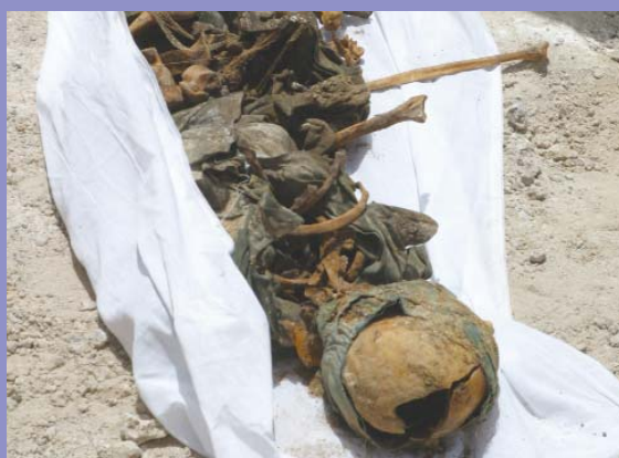
A victim found in a mass grave in Musayib still wears a blindfold.