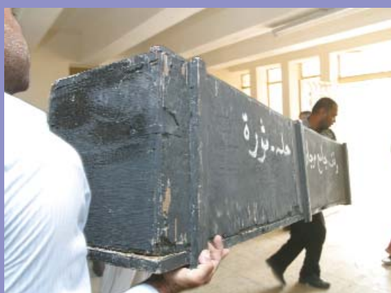
After identification and preparation for reburial, a victim is moved from the morgue by family members.