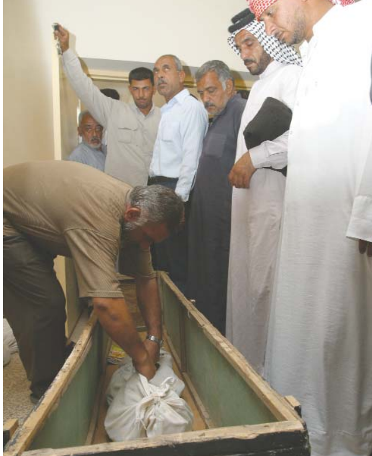
Remains unearthed in a mass grave in Musayib are prepared for reburial by family members.

There are ongoing efforts to collect, verify, and combine information on suspected mass grave sites. A Danish forensic team arrived in Iraq in October, and a Finnish team was expected soon after. Swedish and German governments have also offered varying levels of assistance. Until the international teams are in place,