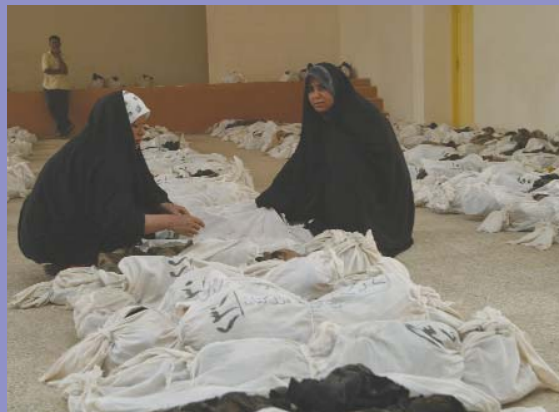
Iraqi women seek to identify remains of lost family members.