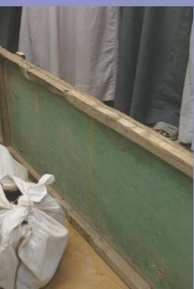
grave are prepared for

He left the neighborhood and changed his identity. He was also protected by an intelligence officer in his neighborhood. When Saddam was toppled, he resumed his identity after having been in hiding for over 12 years. He is a member of the Human Rights Association of Al Hillah. ■