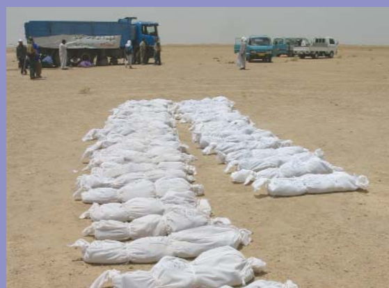
Remains of Iraqis removed from a mass grave in Musayib lie wrapped in linen shrouds.