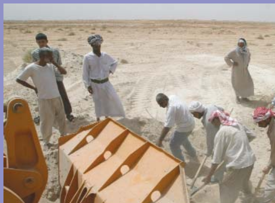
Iraqis dig for remains from a mass grave in Musayib.