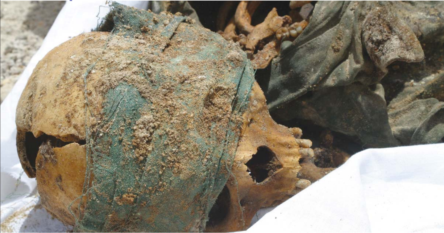
A victim, still blindfolded, found in a mass grave in Musayib.