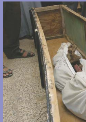
Remains unearthed in a mass reburial.