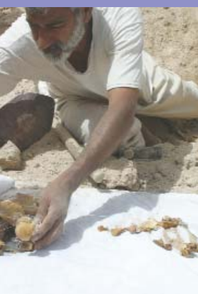
ains. When identified, victims taken to a makeshift morgue.