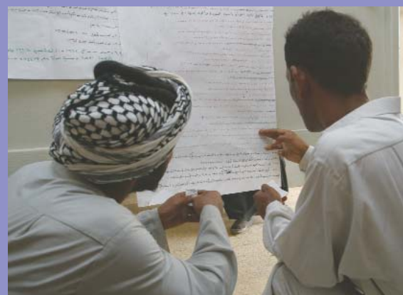
Iraqis look at lists of victims unearthed from a mass grave in Musayib.