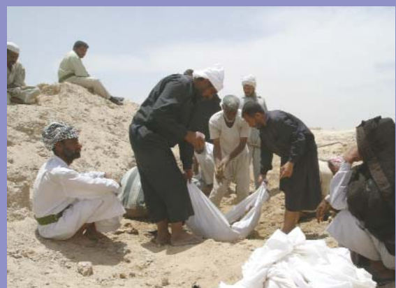
After identification and sorting, remains are tagged, wrapped in linen shrouds, and taken to a makeshift morgue.