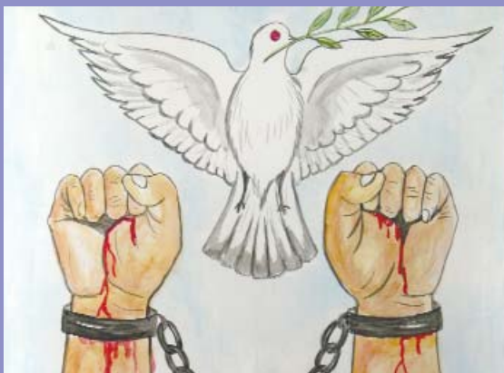
Logo for the volunteer grassroots organization, the Association of Free Prisoners and Missing Persons.