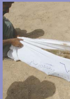
After identification and sorting, linen shrouds and taken to a n