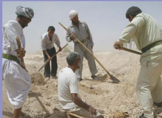
Iraqis dig for remains.