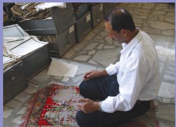
Volunteer takes a break from sorting documents to pray.