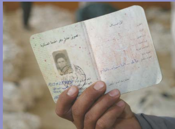
An identification card found in a mass grave in Musayib.