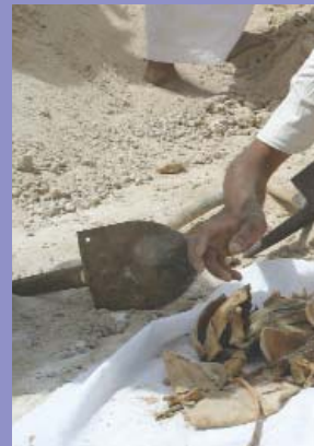
Workers identify and sort remains. Victims are wrapped in shrouds and taken to the cemetery.