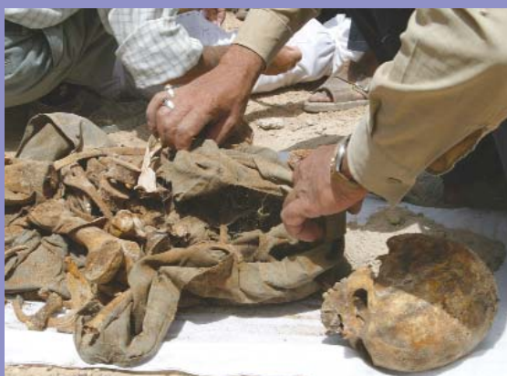
Workers search remains for identifying items. .