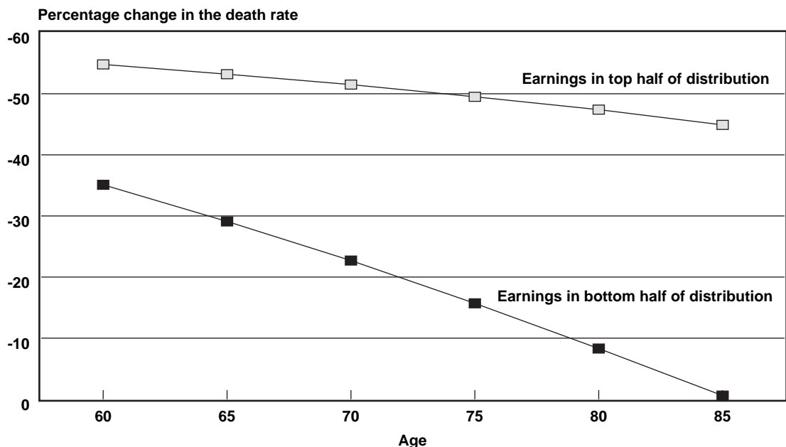
Chart 2. Percentage change in the death rate for male Social Security–covered workers, by selected age and earnings group from birth years 1912–1941