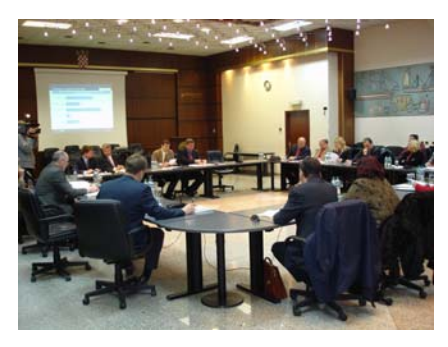
USAID supported discussions throughout the country to inform the public and political parties on the benefits and cost of direct election of mayors. In 2006, the Government accepted the draft law, which is now in Parliament for adoption.