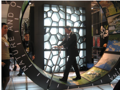
A visitor at the World Tourism Market in London walks inside the "tourism wheel" at the USAID-supported BiH stand which won the award for the best stand feature