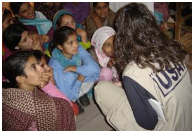
Students of the newly re-opened school talk with a USAID representative.