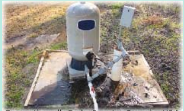
Domestic well, Early County, Georgia, USA

Statistical methods are being used to summarize properties and constituent concentrations nationally and by principal aquifer. Water-quality in domestic wells also is being related to natural features (for example, rock type), geochemical conditions, and land use.