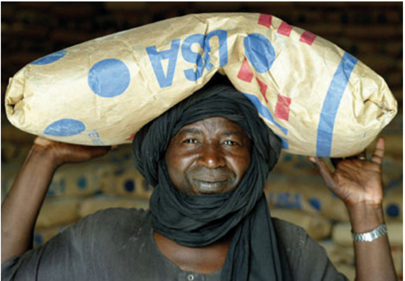
U.S. regional programs in West Africa support local populations.

In Monterrey, Mexico, President George W. Bush called for a new compact for global development to link greater contributions from developed nations to greater responsibility from developing nations. In response, the United States established the MCC in 2004 to work with some of the