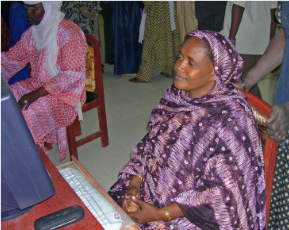
Clients using a Community Information Center in Mali.

The U.S. bilateral TCB assistance to LDCs participating in the IF process has risen from $36.6 million in 2001 to over $132.9 million in 2005. This is supplemented by U.S. contributions to the IF trust fund and to related programs of the International Trade Centre in Geneva.