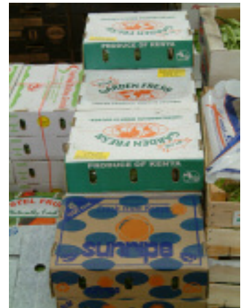
Produce from Kenya ready for shipment, locally or worldwide.

Other assistance ranges from energy services to sustainable tourism. The South Asia Regional Initiative includes an energy component that promotes mutually beneficial energy linkages among the nations of South Asia. The program promotes an understanding of the benefits of regional energy trade and builds capacity for energy trading opportunities. In Ecuador, technical assistance and training supports local-based ecotourism as a productive alternative to overfishing, enhances local governance, and promotes a marine zoning plan.