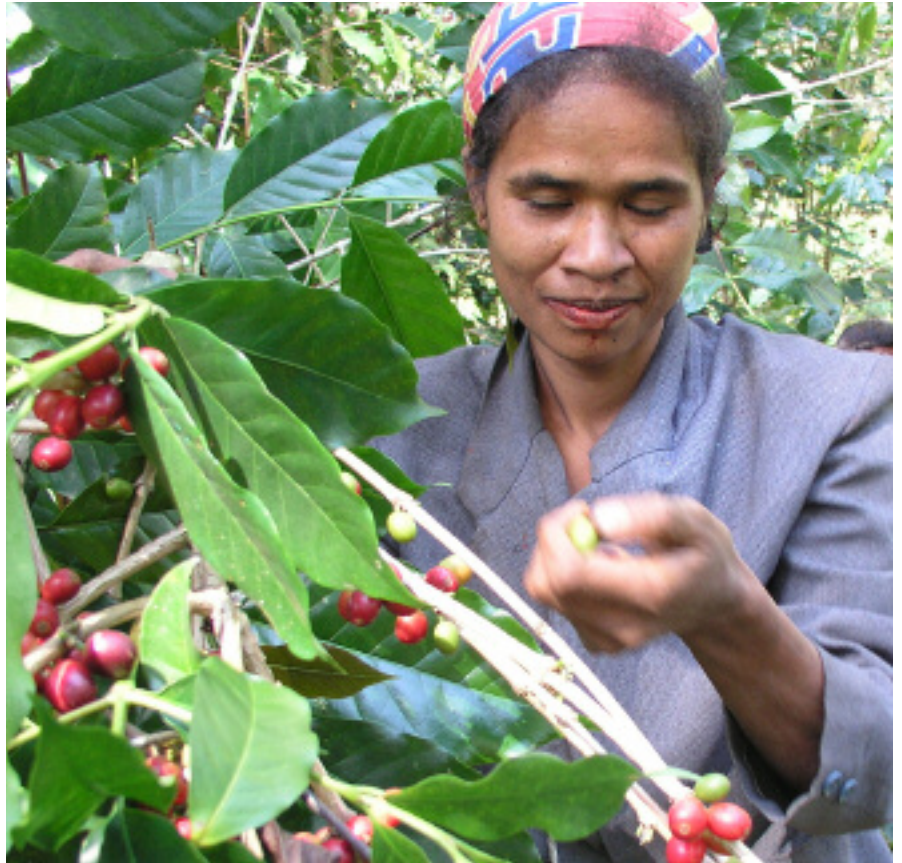
East Timor coffee farmers expand sales by identifying potential markets for certified organic coffee.

The United States is the largest single-country donor of TCB assistance, providing over $1.34 billion in 2005, up from $921.2 million in 2004. The United States' Millennium Challenge Account (MCA) contributed to TCB funding for the first time this year, complementing on-going U.S. programs. In addition, we continue our strong support for the trade-related programs of the multilateral