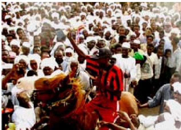
The winner of the South Darfur Equestrian Festival celebrates.

Complementing the main event of horse racing, the Equestrian Festival featured nationally known singers, academics, poets, and comedians, all of whom showcased the benefits of unity, cultural diversity, and peace. Attendees said the event reminded them of a time when conflict was less pervasive and regional centers like Ad Daein, hundreds of miles from Khartoum, had a more prominent role in people's lives. According to one observer, the event "shocked people out of conflict mode."