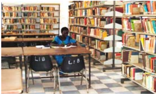
A woman reads in Juba University's rehabilitated library.

The reopening of the Juba campus is a key symbolic step in the development of Southern Sudan and the transition from war to peace. The University of Juba continues to maintain its tradition of accepting students from all parts of Sudan, and the university administration is working with the student union to ease the concerns that new Northern students may be harassed. In one initiative, the university organized bus excursions in and around the city to allow Northern students to meet Southerners and foster social interaction across ethnic and regional lines. ♦