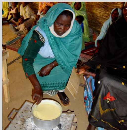
A woman prepares a meal in Mornei camp.

USAID partner Concern provides critical nutrition programs in the camp to combat the problem. Concern employs 300 community volunteers to survey the camp’s population for malnutrition. An outpatient therapeutic program refers patients with medical complications to the nearby clinic for treatment, while others are directed to the supplementary feeding center. From then on, patients come to the center twice a week for a distribution including oil, sugar, and corn-soya blend. The center treats an average of 250 malnourished children a month. ♦