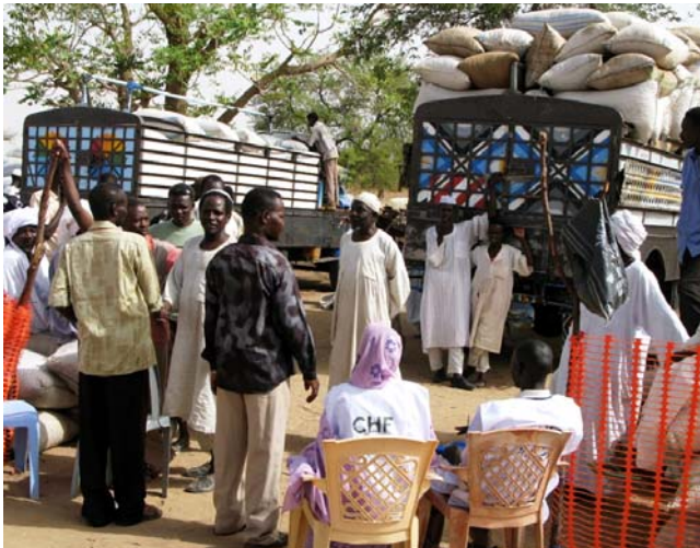
Truckloads of local seeds arrive for the fair in Dibbis, South Darfur.

With support from USAID and the UN Food and Agriculture Organization, and in close collaboration with the Ministry of Agriculture and the Agricultural Research Corporation in Nyala, Cooperative Housing Foundation (CHF), American Refugee Committee (ARC), and World Vision conducted seven seed fairs in Nyala, Kass, and Ed al Fursan in South Darfur during the May-to-June planting season. Farm households were assessed initially to determine seed budget based on their household size, the farm size