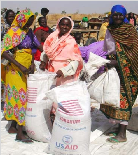
Sorghum distribution, Kalma camp.

USAID is the world’s leading donor of food assistance to Sudan. Since October 1, 2006, USAID has provided 388,020 metric tons of emergency food aid worth more than $389 million to Sudan and Eastern Chad. Approximately 75 percent of this total goes toward feeding displaced people and refugees in Darfur and Eastern Chad, where conflict continues to disrupt food security. The remaining 25 percent is allocated to people in Southern Sudan, Eastern Sudan, Abyei, Blue Nile, and Southern Kordofan, where food aid continues to play a vital role in supporting returnees to Southern Sudan and helping communities recover from two decades of civil conflict.