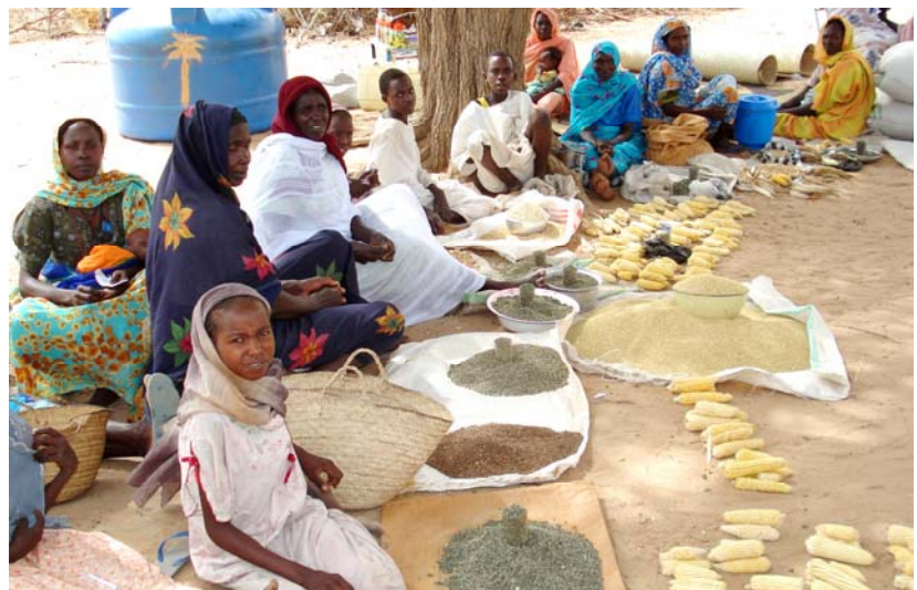
Small farmers display locally grown seeds at a fair in Safia village in South Darfur.

The Three Areas are Abyei, Blue Nile, and Southern Kordofan.