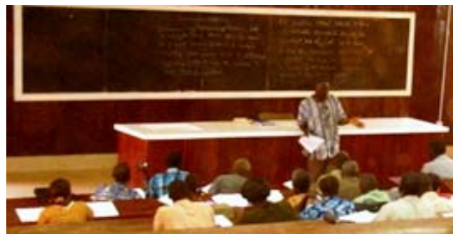
A professor teaches in Juba University's rehabilitated lecture hall.

With these core facilities functional, the university was able to restart undergraduate courses this spring. In early April, 600 first-year students transferred from Khartoum to join 200 students already studying in Juba—the first step in the eagerly awaited return of the university to its original home. Another 1,000 students will transfer from Khartoum in 2008.