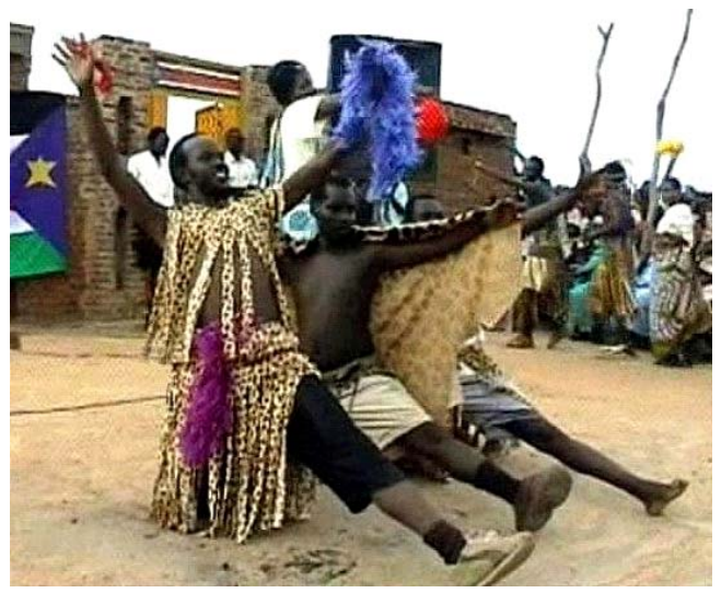
Dramatic performances along Sudan's North-South border disseminate messages of peace.

Despite the signing of the Comprehensive Peace Agreement (CPA) in January 2005, ethnic tensions continue to foster volatility in states along Sudan's North-South border. Strained relations among