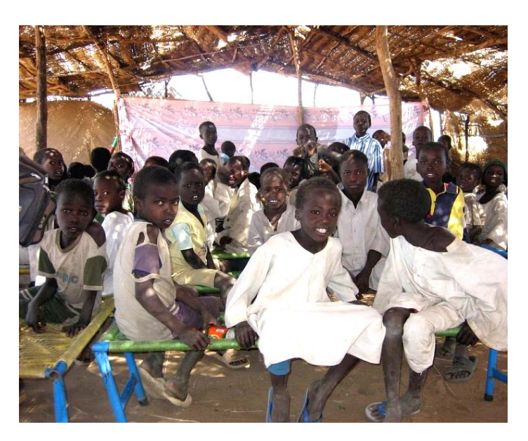
USAID works with youth in Darfur's camps to promote peace and raise awareness of issues like violence against women.

Not only do these activities help give idle youth positive and productive pursuits, they may also dissuade them from participating in other activities that would create further insecurity in the camps and could jeopardize the provision of humanitarian assistance.