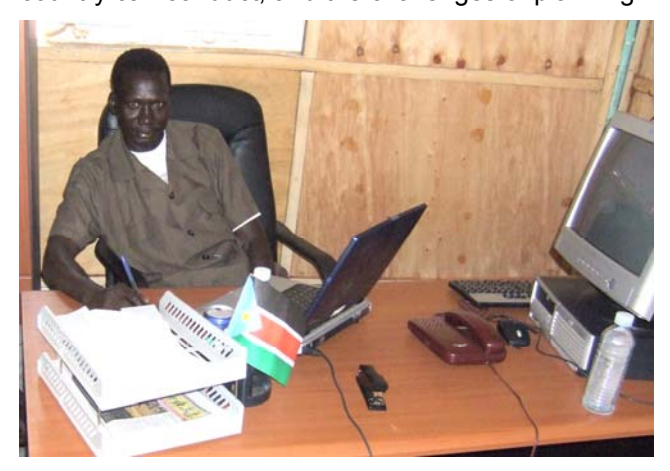
USAID equipped 10 state statistics offices in Southern Sudan to support the upcoming census.

A census is the largest statistical operation that a country can conduct, and the challenges of planning