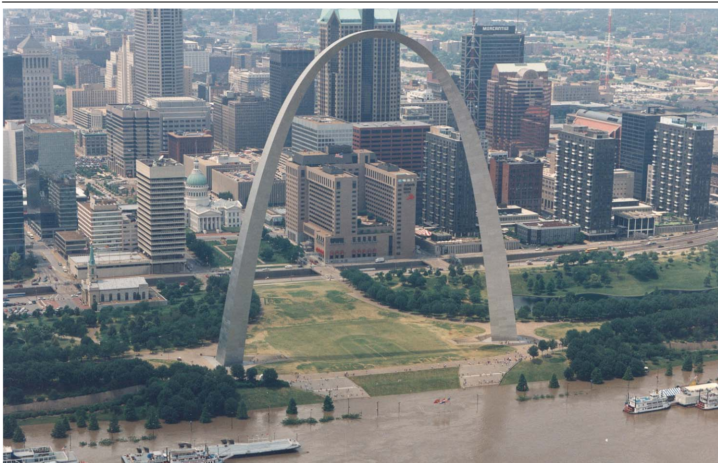
The Mississippi River at St. Louis, Missouri, was within 100 feet of the Jefferson National Expansion Memorial at a record stage of 49.58 feet (photograph courtesy of the Missouri Highway and Transportation Department).