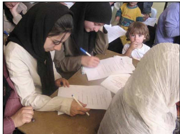
The ASUDA Organization for Combating Violence Against Women - an Iraqi civil society organization based in Sulaymaniyah governorate - has received a support from USAID's Local Governance Programs.

At the local level, USAID helped to increase