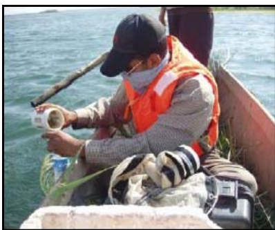
A marsh monitor collects water samples to test water quality in the marshlands

Monitoring results show that excellent progress is being made in the restoration of biodiversity in the marshlands.