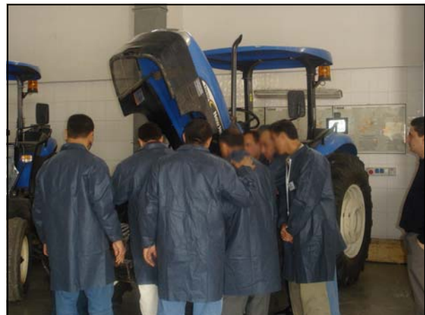
Nine Iraqi mechanics recently attended an advanced training course at the CNH facility in Turkey. After the five-day course in tractor maintenance and repair, the mechanics returned to their independent workshops to train other mechanics.

USAID partners are also training additional Iraqi mechanics to set up independent repair workshops in rural areas where services for agricultural machinery were not previously available. Nearly 30 Iraqis were trained and received essential tools in a recent program; USAID plans to train and equip up to 150 more rural mechanics over the coming months.