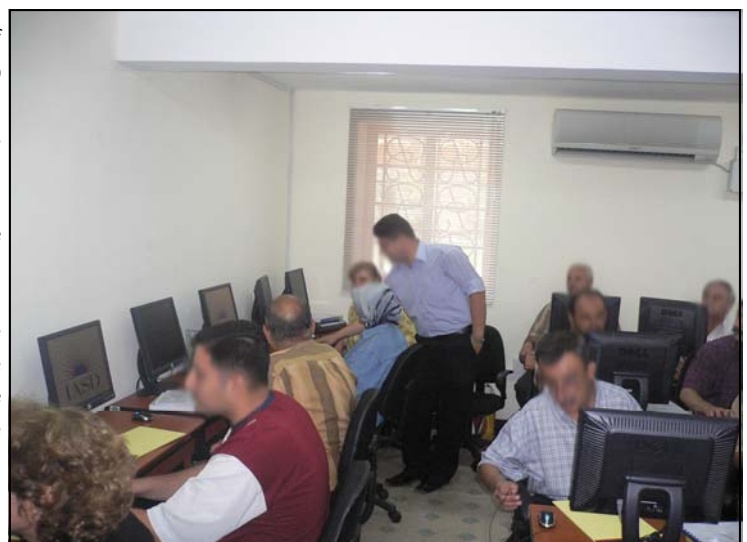
Over 50 Iraqi brokers are currently receiving training and technical support at the new IASD headquarters.

The training program is part of IASD's effort to prepare Iraqi brokerage companies for upcoming automated trading on the ISX. "This is the best training program I have attended" said one attendant. "We are truly grateful to the people who are contributing a great deal to see a real development in Iraq's capital markets".