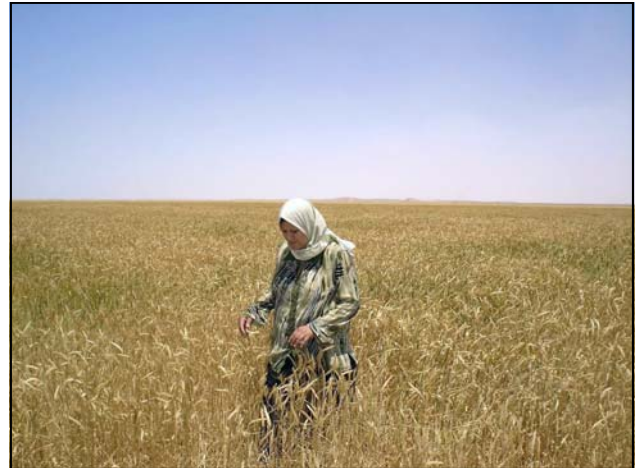
An Iraqi agricultural engineer inspects a field of salt-tolerant wheat in Muthanna governorate, southern Iraq.

In order to increase the availability of salt-tolerant wheat seed in Iraq, USAID and MOST are multiplying the 14 tons of seed of Furat and Dijla wheat varieties, which should produce at least 120 tons of seed for the next wheat season. The 14 tons of seed were planted in December 2005 to 100 hec-