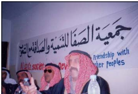
At a workshop in Anbar governorate, an Iraqi trained by ICSP discussed corruption and proposed measures the community could take to combat the problem.

USAID is building the capacity of local Iraqis to fight corruption in their own communities