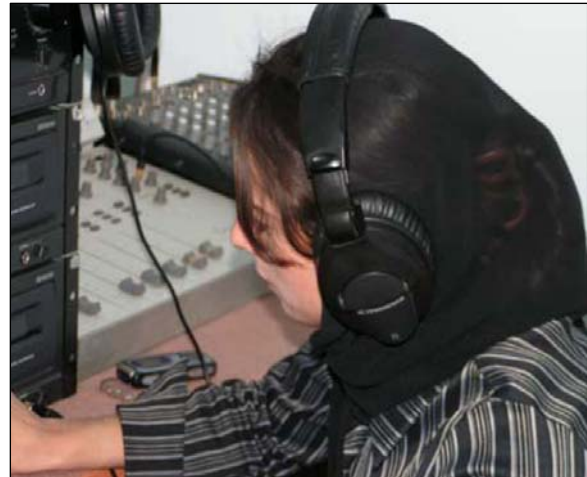
After suffering decades of oppression, Halabja is now listening to the first sounds of freedom. A grant from USAID's Community Action Program (CAP) purchased equipment and furniture to support the launch of the first independent radio station in Iraq—a station operated by women and devoted to women's programming.

A countrywide program for agro-ecological zone mapping, essential for land planning, has depended heavily on women staff from