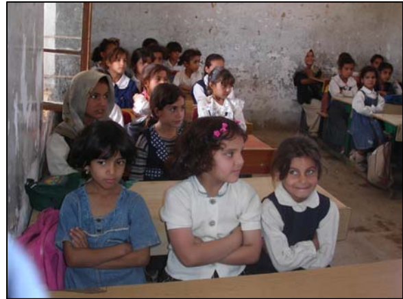
Through building restorations, public outreach campaigns, and new, single-gender classrooms, USAID programs have worked to encourage girls from rural communities to return to school.

been enrolled catch up with their peers and receive a primary education. Girls learn life skills and gain the academic background necessary to return to formal schooling.