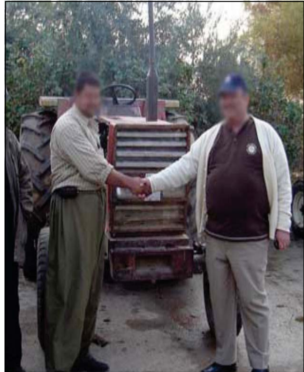
A tractor owner receives his repaired tractor. For the first time in years, it is ready for use in agricultural production. USAID's tractor repair program will restore at least 5,000 inoperable tractors by September 2006.

USAID's Agriculture Reconstruction and Development Program for Iraq (ARDI) provides technical assistance and support to jump start Iraq's agriculture sector. Restoring essential equipment, including tractors and irrigation systems, is part of the larger effort to restore agricultural production and develop the private sector. Other efforts, outlined elsewhere, include training farmers and ministry officials in modern agricultural methods, the use of new equipment, and land and water management. Already, demonstrations of a cost-effective technical package on test plots have shown a 40 percent average increase in wheat yield.