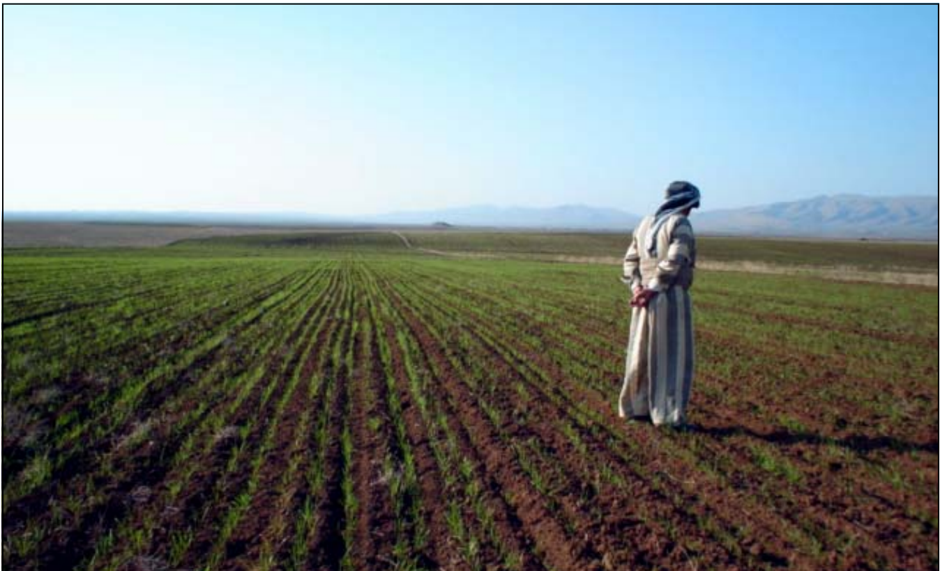
An Iraqi farmer in Dohuk inspects a USAID-supported wheat demonstration field. In coordination with the MOA, USAID has established five seed multiplication plots in Dohuk and, countrywide, over 40 wheat demonstration plots like the one above.

In addition to grain improvement efforts, USAID's National Wheat Program is developing a system of pesticide management, training farmers in the use of fertilizer, and restoring dilapidated tractors. Future projects will further enhance production meth-