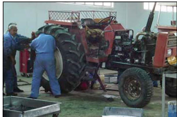
Mechanics at one of 14 workshops around the country repair a tractor as part of USAID's tractor repair program. The 180 Iraqis employed at the workshops will continue to provide tractor repair services after the end of the project.

The completed rehabilitation of these 5,000 tractors will benefit both farmers, who will earn increased revenue from greater production due to expanded and improved cultivation, as well as tractor owners, who will earn increased service revenue from contract services. The program will expand cultivated lands by approximately 45,000 hectares and allow for more intensive and timely cultivation of existing land. In all, the program will help produce 67,500 metric tons of additional wheat, generating over $4.7 million in annual grain sales, and allowing for $5,400/tractor annually in contract services.