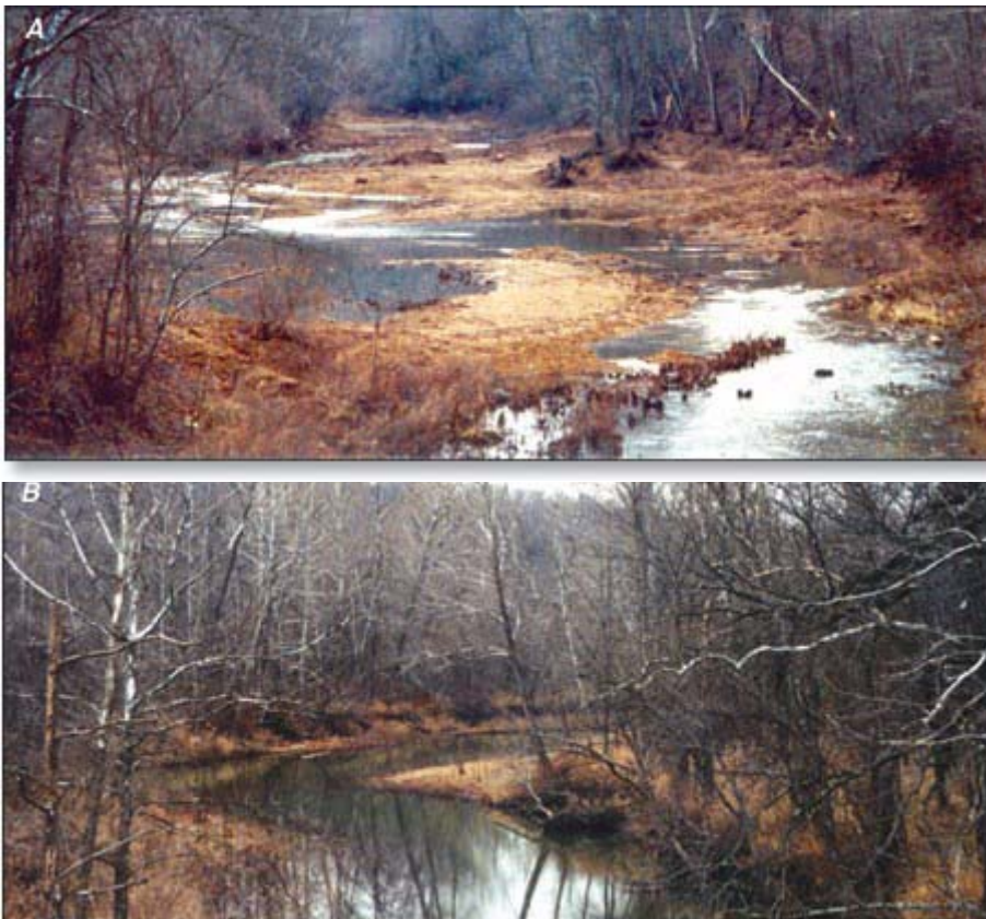
Figure 3. Barren Fork in Miller County, Missouri, 2000. A, Active instream gravel mining B, the natural channel approximately 100 meters downstream from photograph A.

Instream gravel mining in Missouri is regulated by the Missouri Department of Natural Resources, Land Reclamation Program (MDNR, LRP) and to a lesser extent, the U.S. Army Corps of Engineers. All commercial gravel operations must obtain a permit from MDNR, LRP, though non-commercial operations and county and local governments do not need a permit. Because many operations do not need to obtain a permit, it is difficult to know the