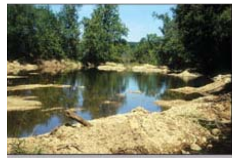
Figure 1. An example of habitat degradation at a gravel mining site at Sellars Creek in Camden County, 2000.

Extraction of gravel from a stream alters the sediment budget creating the potential for channel instability, increased turbidity, and degradation of habitats (fig. 1). Wetlands may be altered or lost by erosion, the lowering of the water table, relocation of the stream channel, or by moving gravel into wetland areas. Instream gravel mining may be linked to loss of fishery resources and wetlands, increased bank erosion, and damage to infrastructure caused by channel degradation. The extent to which this potential is realized depends on the hydrologic character, sediment load, and riparian condition of a stream. In Missouri, there is little information about the extent and distribution of instream mining. This information is needed for a science-based understanding for future instream mining policy in Missouri.