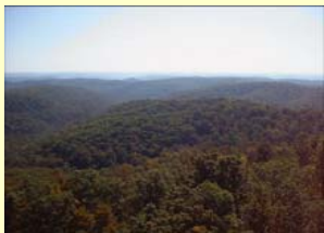
A typical Ozark landscape.

The Ozark Plateaus of southern Missouri and northern Arkansas are a temperate, mostly forested region that is one of the oldest continually exposed landscapes on earth. Plants and animals have had over 200 million years to adapt to the rugged landscape, or take refuge from continental climate change. Its geographic isolation, topographic relief, karst geology, and good water quality have resulted in remarkable biodiversity. The plateau is underlain by widespread, gently dipping limestone and dolomite formations that are known for their well developed karst features. Sinkholes, caves, springs, and gaining and losing streams, define the hydrology of much of the Ozarks. Streams in the region are particularly vulnerable to rapid and unpredictable changes in water quality. Sinkholes and other point recharge locations provide a direct pathway for point source contaminants—from leaks, impoundment failures, or spills—or non-point source contaminants from land use practices to enter the subsurface. This study is focused on two sites: The Ozark National Scenic Riverways, located along the Current River and Jacks Fork of the Current River, and The Buffalo National River in northern Arkansas. Both sites are managed by the National Park Service.