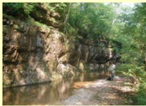
A typical Ozark stream.