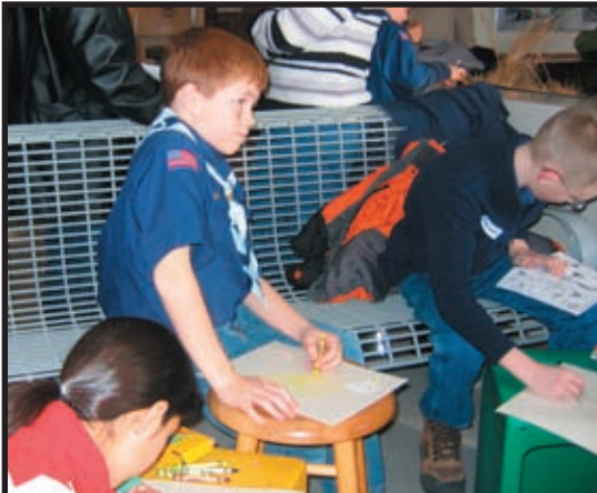
Scouts draw a local bird.

Lynnette Wilfling Refuge Scout Day Volunteer