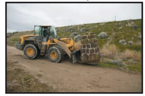
A CCC-built pillar is moved in advance of dam repairs. It will be installed along the new road or new historical trail.

Eleven partners agreed to work with the Friends and the refuge to research the history of the refuge and the reservoir, including documenting the role of Lake Lowell in the development of southwest Idaho and in the lives of local residents.