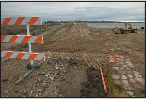
View east along the Upper Dam across the breach where the Caldwell Canal is being repaired.

"On busy weekends last summer, the overflow lot was often filled with over 60 parked cars," according to Susan Kain, refuge Visitor Services Manager. "Because there will be no place for those vehicles to park while the road is closed, we are encouraging people to use the Lower Dam Recreation Area. or even to travel to Lucky Peak or Owyhee Reservoir" until all of the dam repairs are completed and boat launching facilities are fully available again in spring 2009.