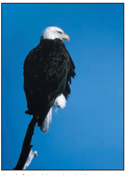
Look for bald eagles in the trees along the Visitor Center lakeshore.

in the lakeshore trees near the Visitor Center, various songbirds at the Visitor Center feeders, and large waterfowl flocks that use the lake as a winter home or migratory resting spot. Although mallard ducks and Canada geese are most common, snow geese, mergansers, and goldeneyes are some of the many waterfowl that have been recently sighted.