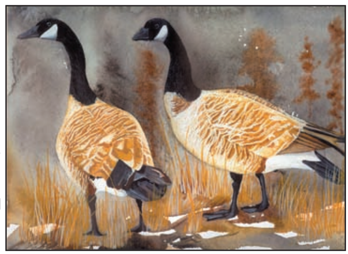
Katie Berberick's 2007 Idaho Best of Show.

Be sure to submit your 2008 entry by March 15th!