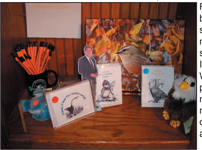
A few of the items available at the new refuge bookstore.

The refuge staff very much appreciates the Friends' efforts. If you think they're doing good work too, then consider joining the group by downloading a form from their website.