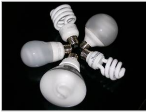
A variety of ENERGY STAR CFLs

The Sierra Pacific/Nevada Power ENERGY STAR Lighting and Appliance Program includes a variety of ENERGY STAR qualified compact florescent lamps (CFLs) including twists, A-lamps, globes, and reflectors. Rate payers can find these styles of bulbs at over ten different retailer channels around Nevada. ENERGY STAR qualified ceiling fixtures can also be found at a local retailer through our program.