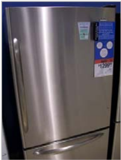
An ENERGY STAR qualified refrigerator

ENERGY STAR is a well known label placed on appliances so the consumer will know that the appliance is going to save energy. However, many people do not know that there is a range of energy efficiency within ENERGY STAR labeled products. Refrigerators that receive a Nevada Power rebate are 20% more efficient than the federal standard requirement. This means that when someone purchases an ENERGY STAR refrigerator that qualifies for the Sierra Pacific/Nevada Power rebate, they are purchasing a top of the line energy efficient refrigerator. As of April 28, 2008 the EPA's criteria for refrigerators to be labeled ENERGY STAR will be raised to our current program's standard (increase of 20% for efficiency).