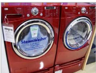
An ENERGY STAR qualified clothes washer

Clothes washers also have different standards of energy efficiency when labeled with ENERGY STAR. Only those washers that are deemed to meet the Consortium for Energy Efficiency (CEE) Tier 3 are eligible for a Program rebate. Most CEE Tier 3 clothes washers will be found as a front loading style.