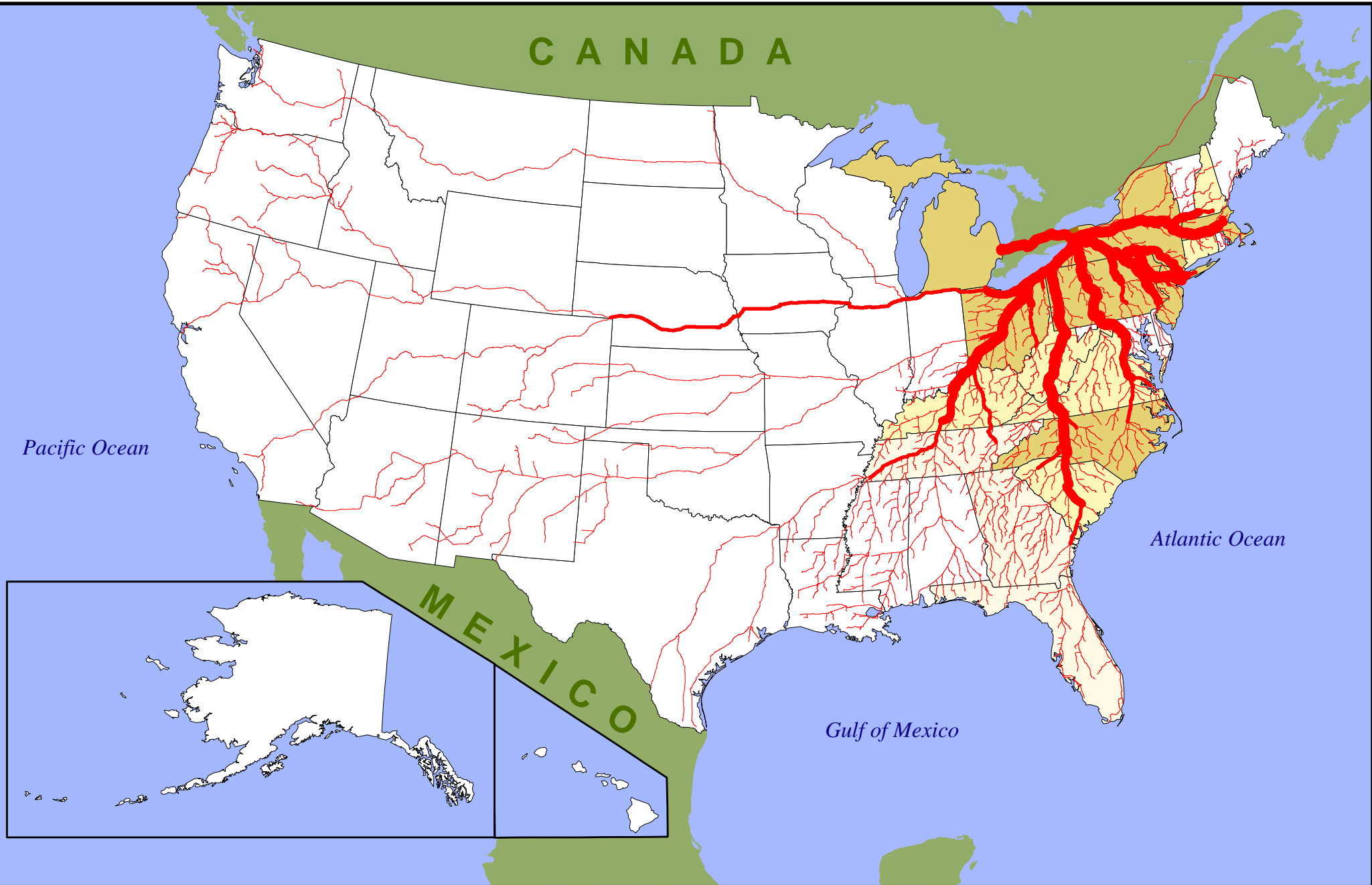
International Truck Flows for Border Crossings (1998)