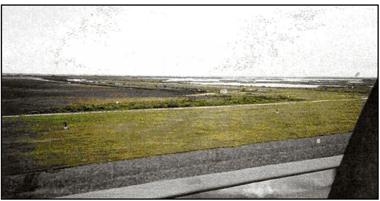
View from the Rainbow Bridge looking west at the East Dike Area