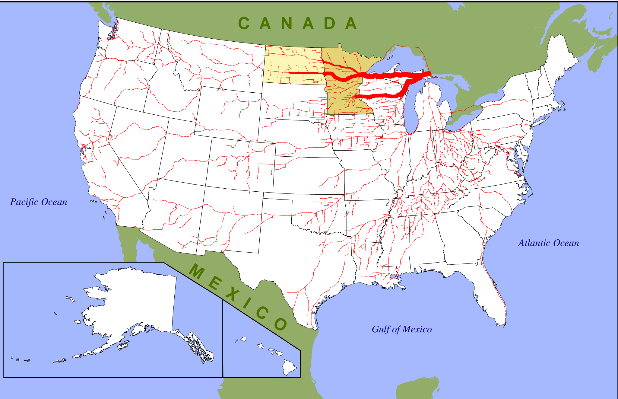
International Truck Flows for Border Crossings (1998)